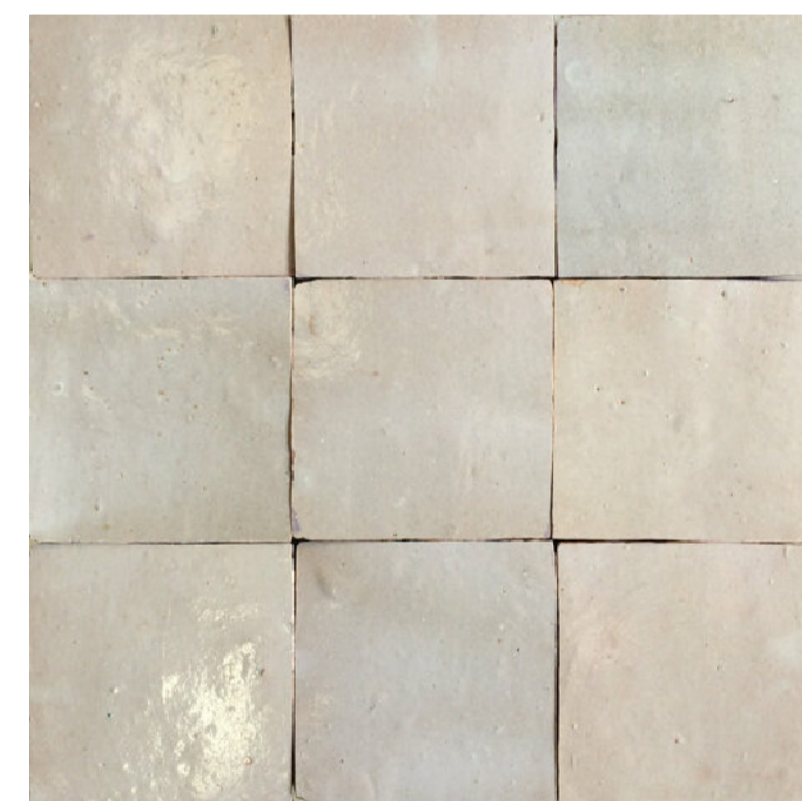
TILE CLADDING- SAMPLE TILES