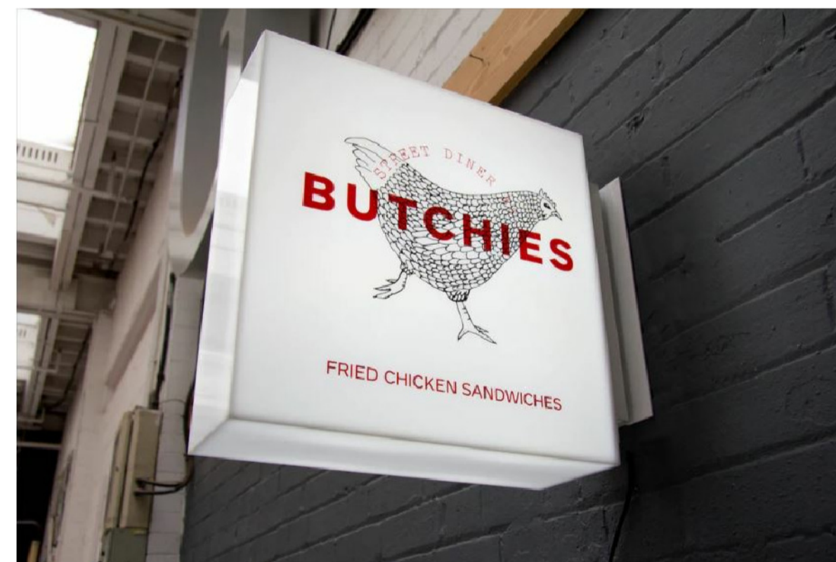
WHITE FRAME LESS PROJECTING SIGNS 400X400MM WITH CUSTOM LOGO AND NAMES