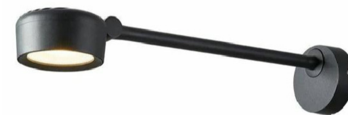
PROJECTING LIGHTS AS SHOWN IN THE DRAWING- PROJECT A MAX OF 510MM