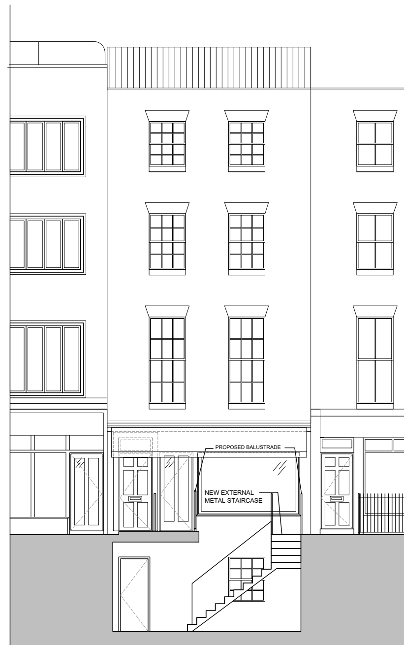
1:100 PROPOSED BB SECTION