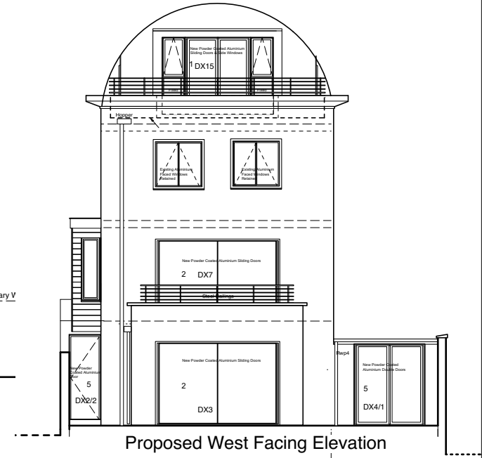
Proposed West Facing Elevation