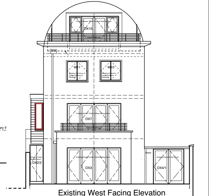
Existing West Facing Elevation