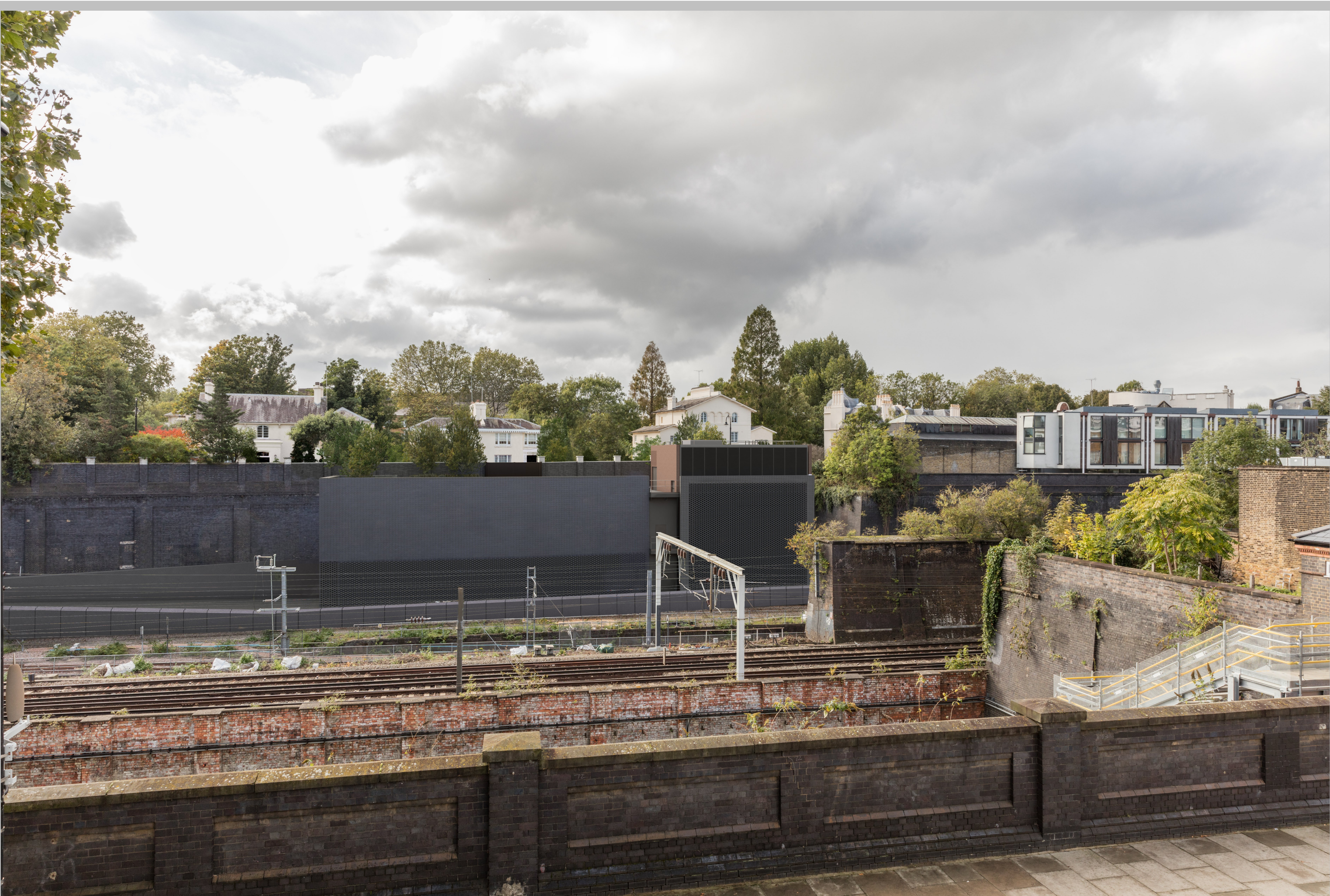
Viewpoint 40 : Operation Year 15