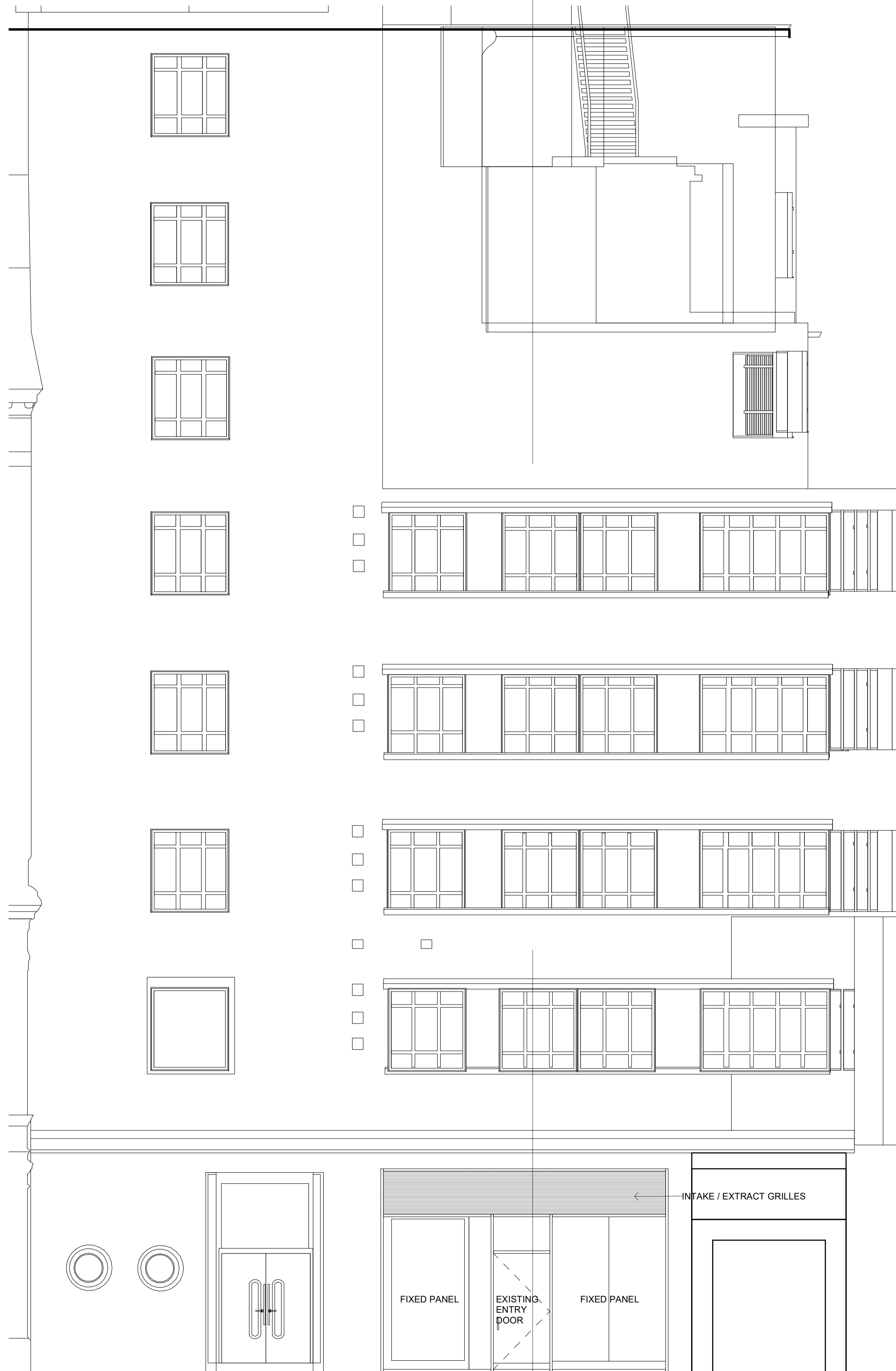
1 Existing Facade Elevation GF-000 1 : 50