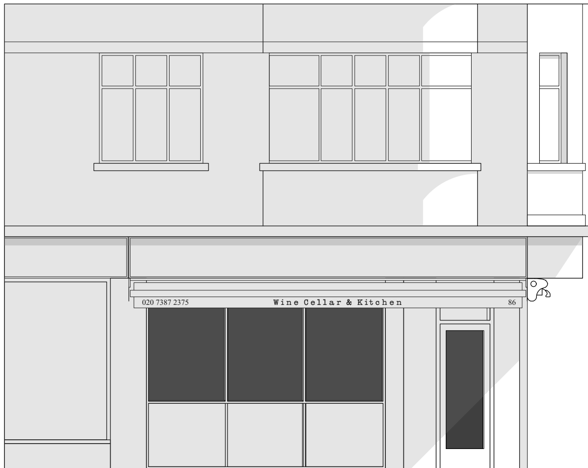
CLEVELAND STREET ELEVATION

DO NOT SCALE FROM THIS DRAWING LEVELS AND DIMENSIONS TO BE CHECKED ON SITE BEFORE WORK COMMENCES. NO MATERIALS OR WORKMANSHIP TO BE INFERIOR TO CURRENT BRITISH STANDARD OR CODE OF PRACTICE