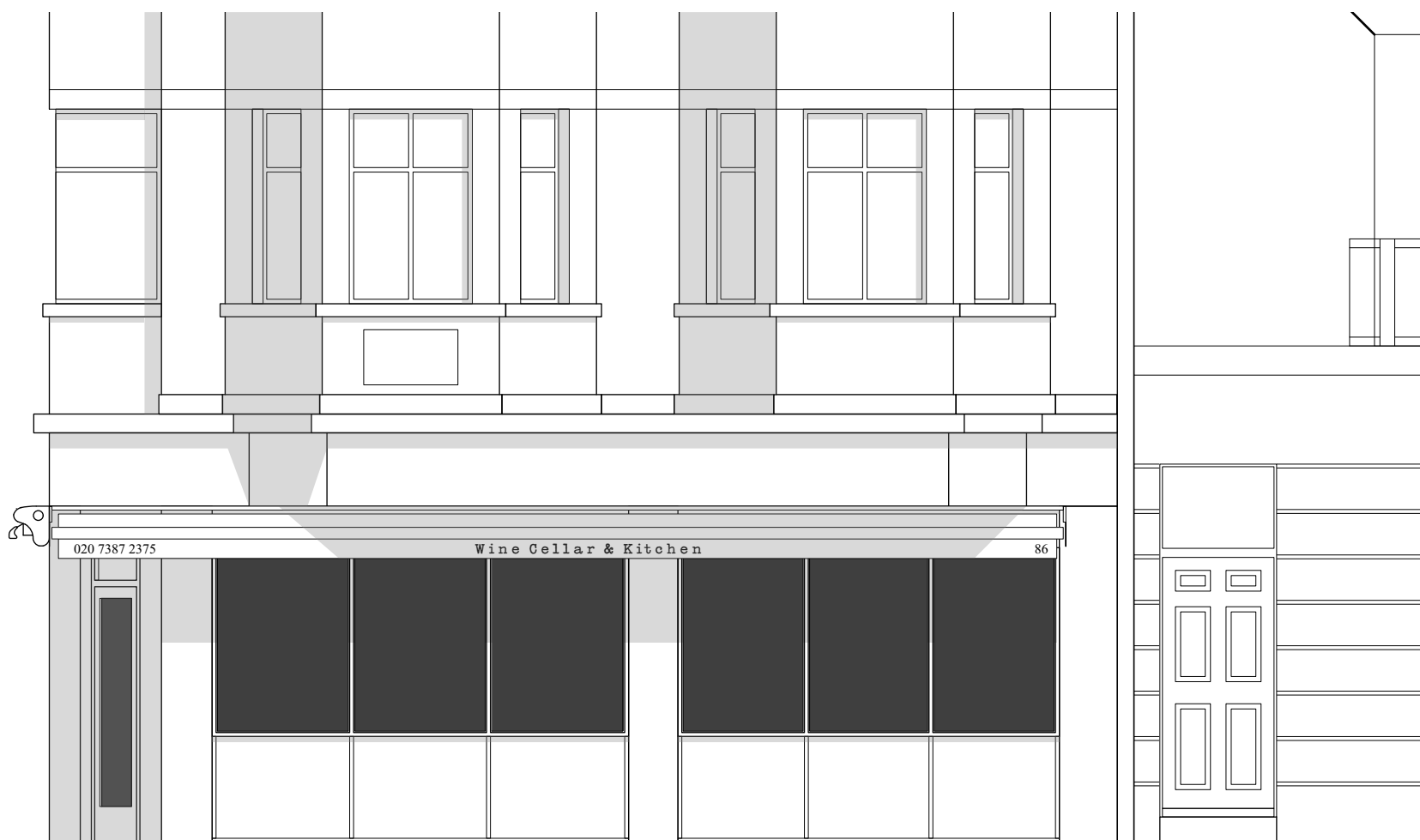
GRAFTON WAY ELEVATION

Revision notes: First Issue. 14/05/22 Planning submission.