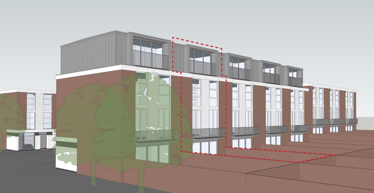
Rear View (No.22 Highlighted)