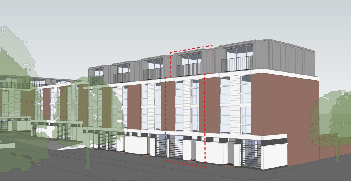
Front View (No.22 Highlighted)