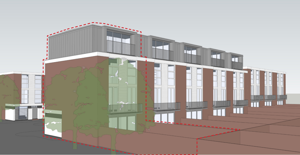
Rear View (No.23 Highlighted)