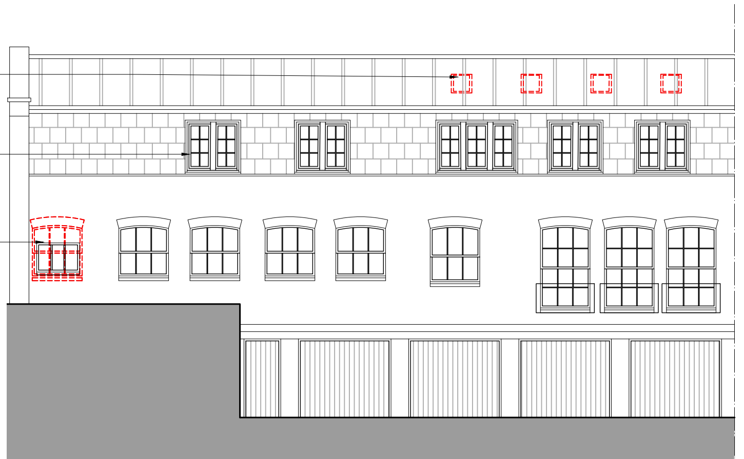
PROPOSED OPENINGS ON ELEVATION B GLOUCESTER MEWS ELEVATION scale 1:100

width increase by a 700mm approx. Additionally inner block is to be cut out to allow for sash box.