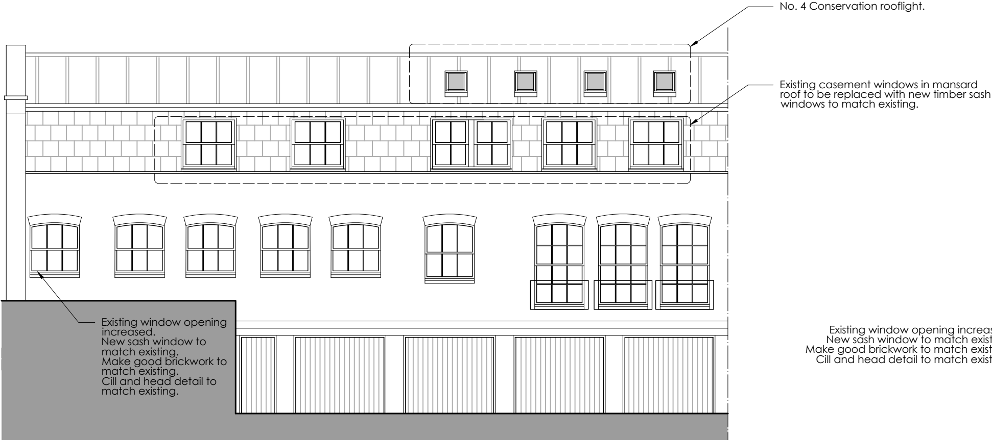
PROPOSED ELEVATION A GLOUCESTER MEWS ELEVATION scale 1:100