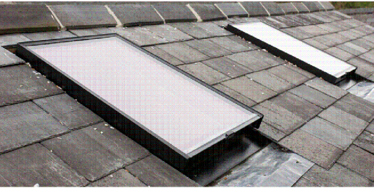
The Conservation Rooflight from The Rooflight Company. Structural opening 720mm x 1350mm approx. Colour: Dark grey (BS00A13). Double glazed. Fixed shut.