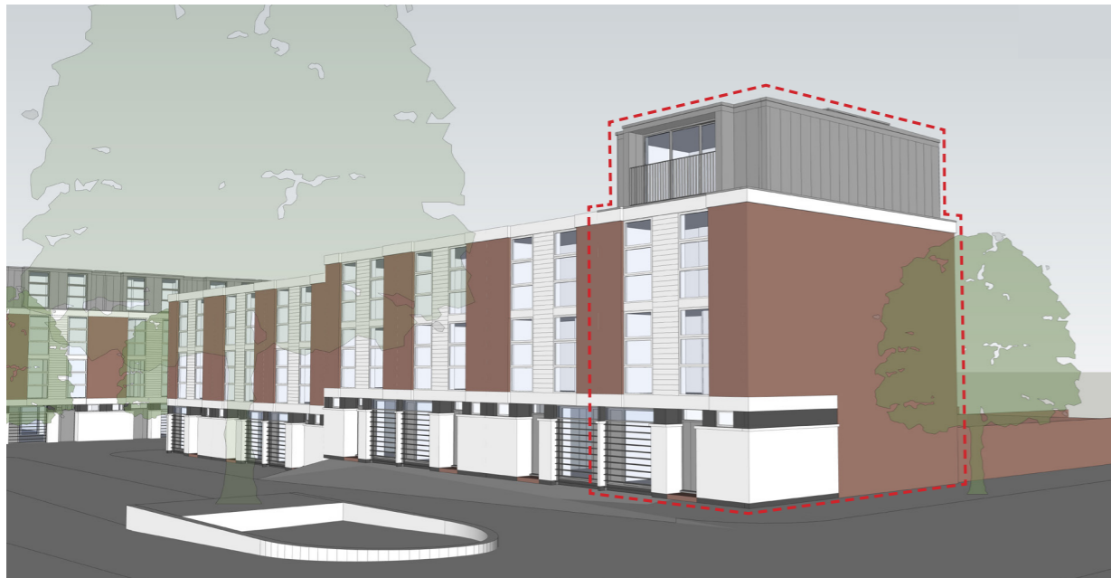
Front View (No.39 Highlighted)