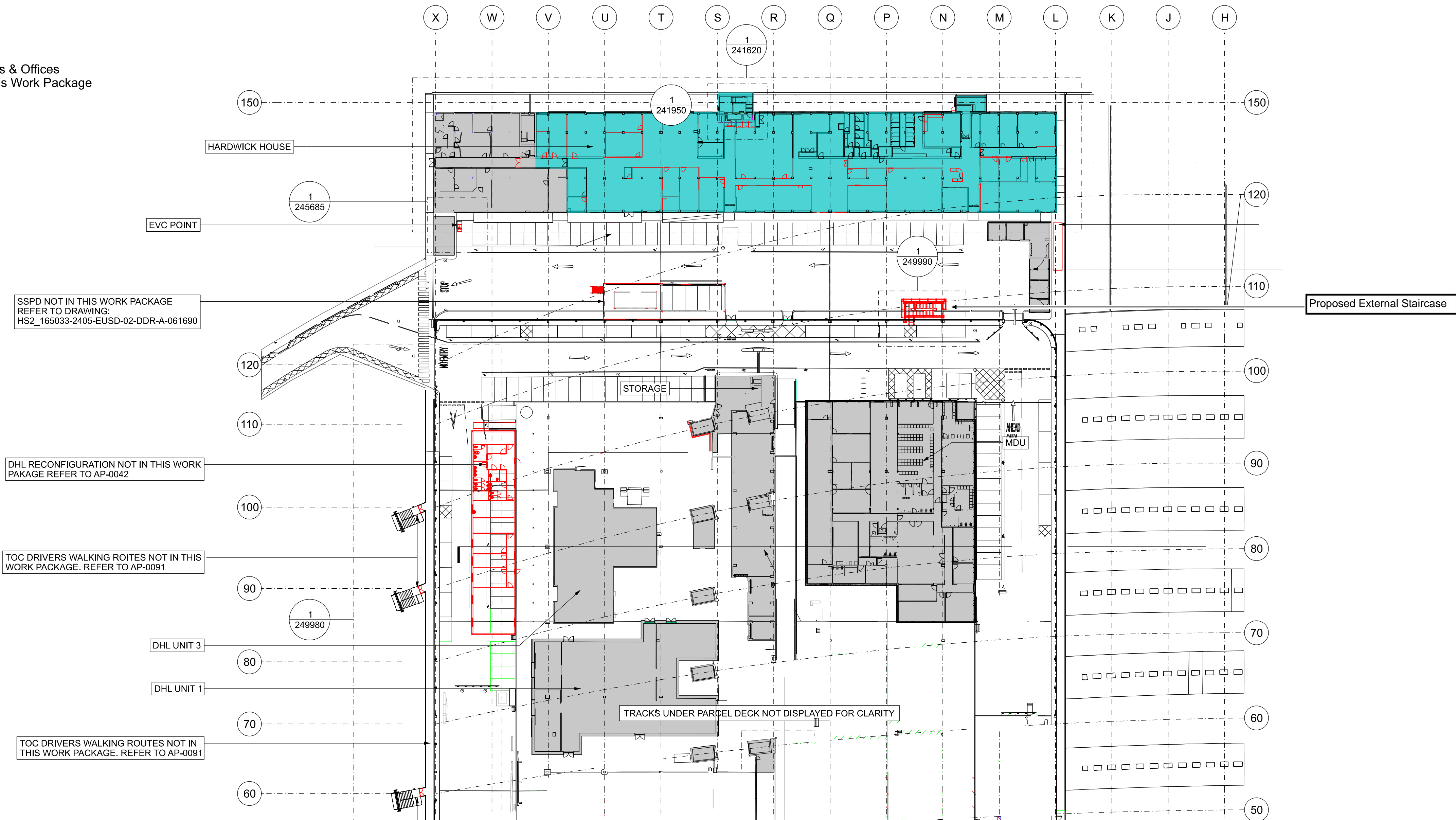
Parcel Deck - Stage B1 Plan 1:500

Existing Buildings & Offices Unaffected by this Work Package