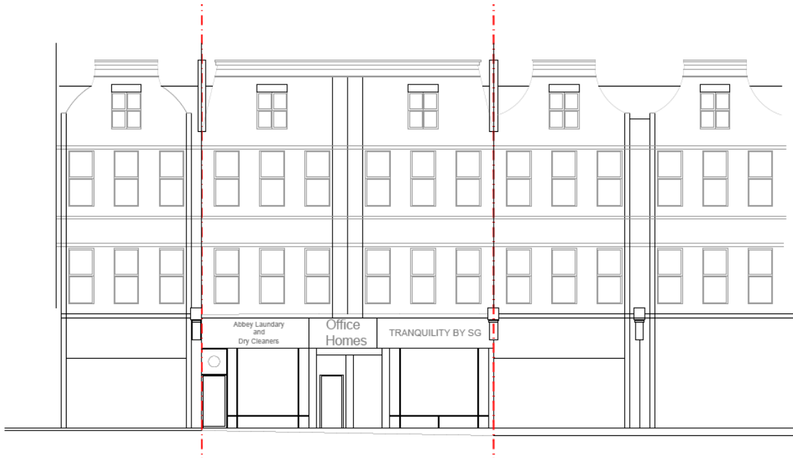
Existing Front Façade

The proposed work in this application is for the ground floor unit only. The applicant intends to redesign the front façade and to change the signage. The overall design of the proposal is similar to the existing, but cleaner and neater. The new façade material will be Alu bond powder coated blue-grey which will integrate nicely with the neighbouring blue/black façade colour. The existing signage was separated into 3 parts and the applicant intended to combine them into 1, for the current usage as a Family Club & Discovery Classes. The access to the upper floor residential units through the middle will remain unchanged.