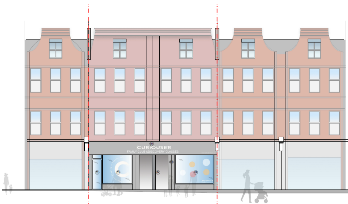
Proposed Front Façade