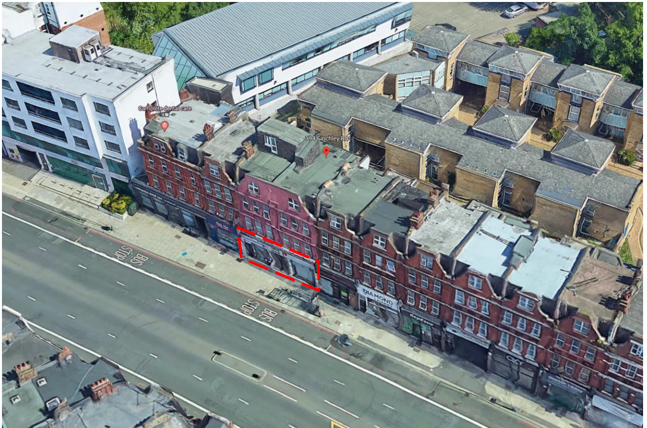
Application site in context