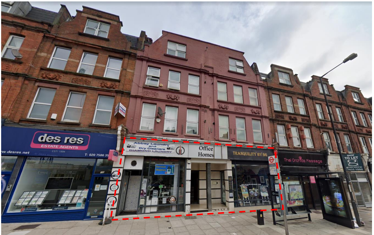
Front View from Finchley Road