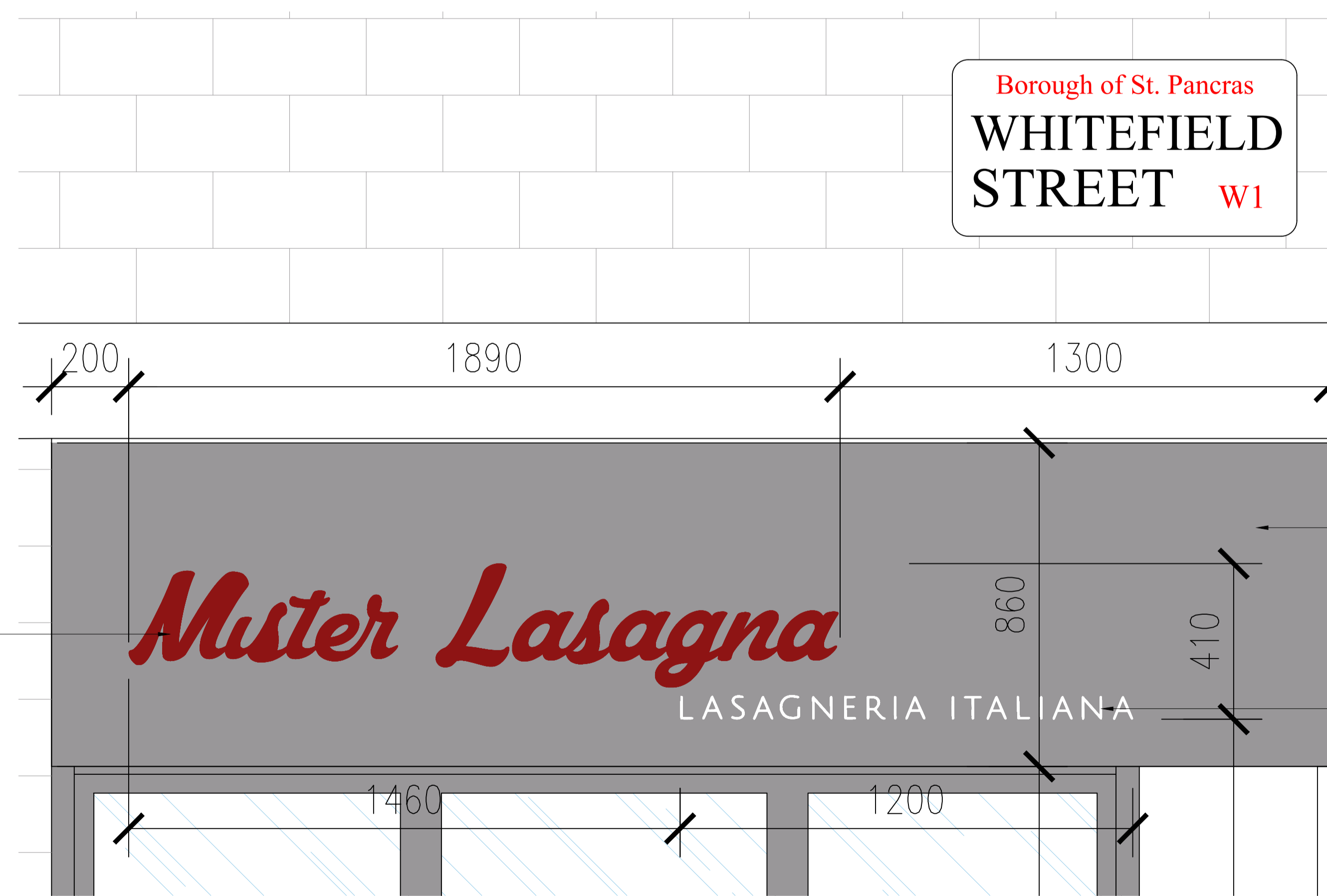
PROPOSED SIDE FASCIA SIGN DETAILS - WHITEFIELD ST SCALE 1:10 @A1