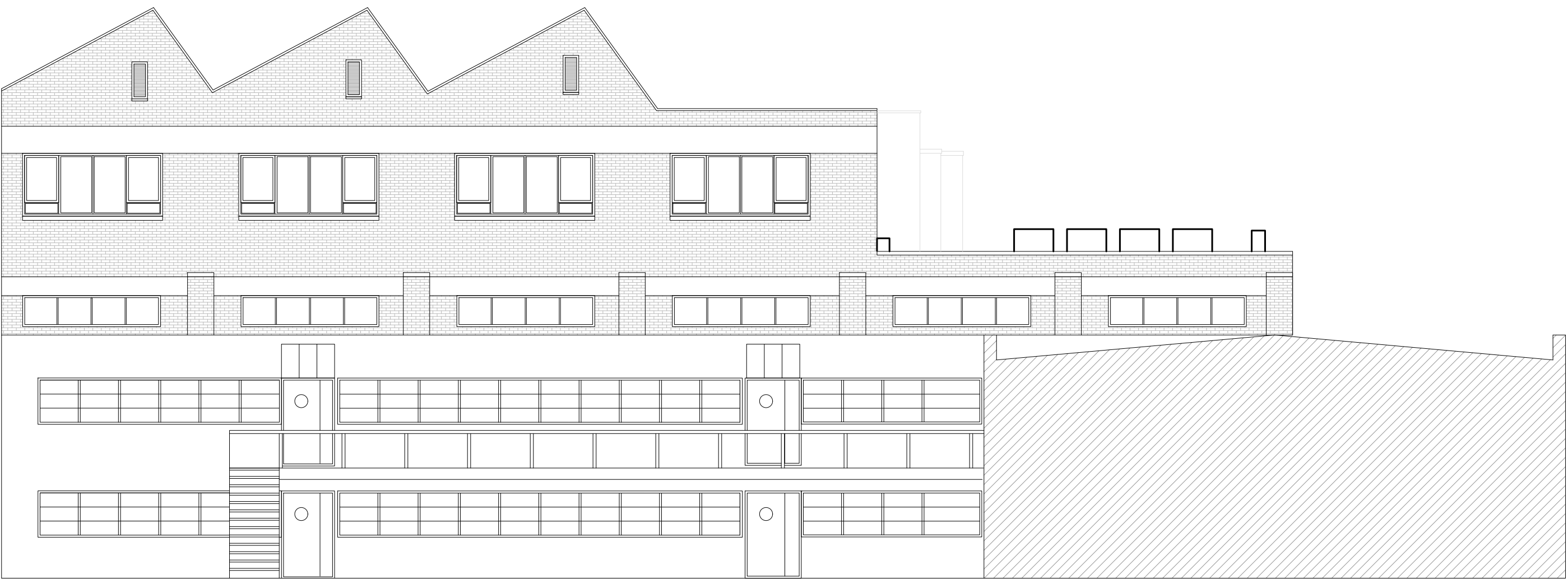
Existing Elevation 6