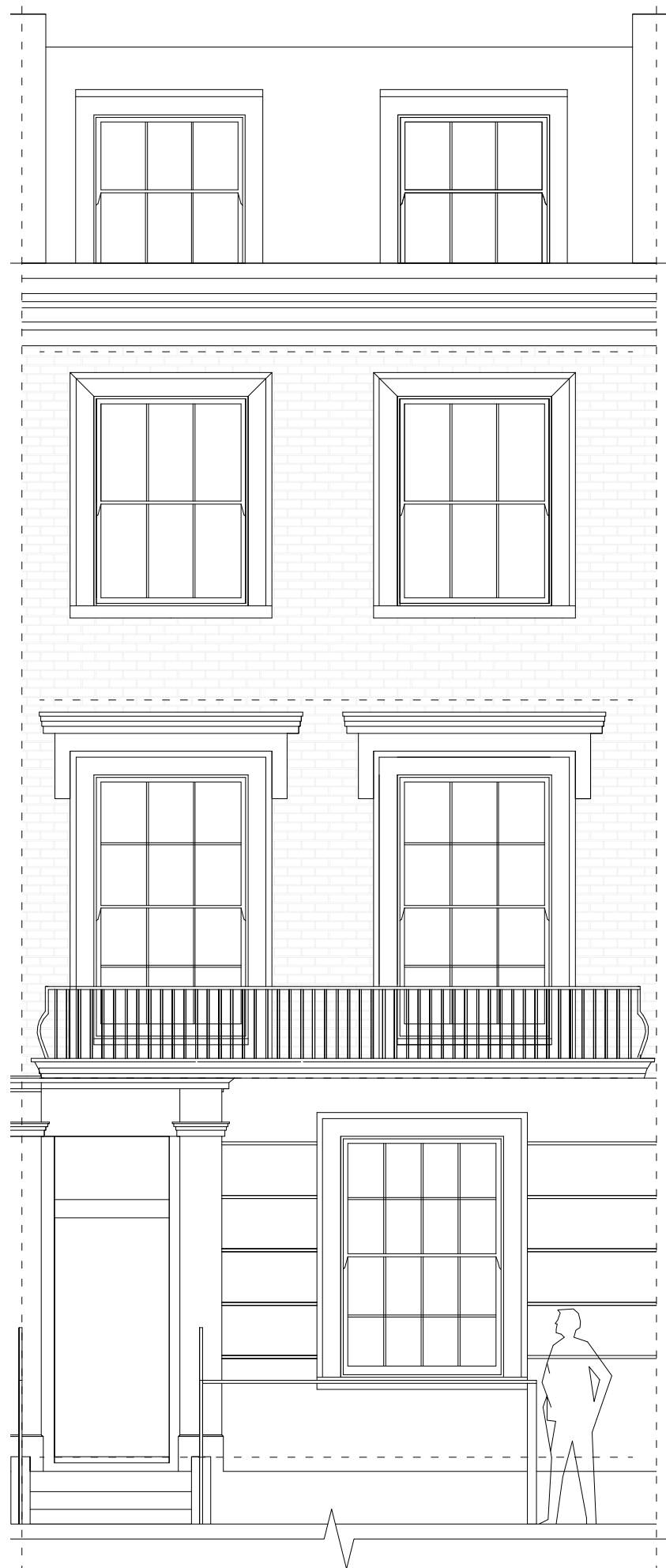
E0 External Elevation, Front (South) Scale: 1:50 No alterations are proposed to front elevation