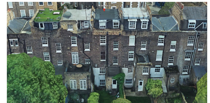
56 Delancey Street Reference photograph showing existing condition (April 2022)

Unless otherwise noted, all dimensions are given in millimetres. Dimensions shall govern and must be checked on site. Do not scale off paper or digital drawings. Any conflicts, errors or missing information shall be brought to the attention of the document originator before progressing further. If in doubt, ask. All existing construction and any proposed interfaces are to be verified on site prior to construction. This drawing shall be read in conjunction with all associated project information & that of other consultants. Final design and construction are subject to detailed measured survey, statutory approvals and contractors/suppliers' requirements. All products and materials to be installed strictly in accordance with manufacturer's written instructions. This document and its design content is protected by copyright.