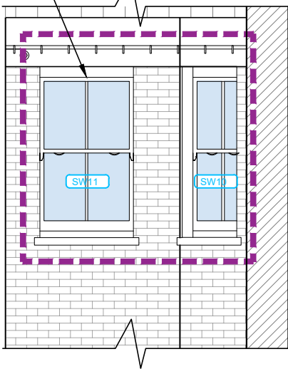
02 | EXISTING SOUTH ELEVATION 'B'_THE PRYORS (COURTYARD) Scale: 1/50 @ A3