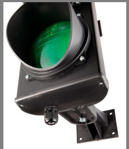
M20 cable entry