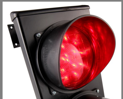
Illuminated red light