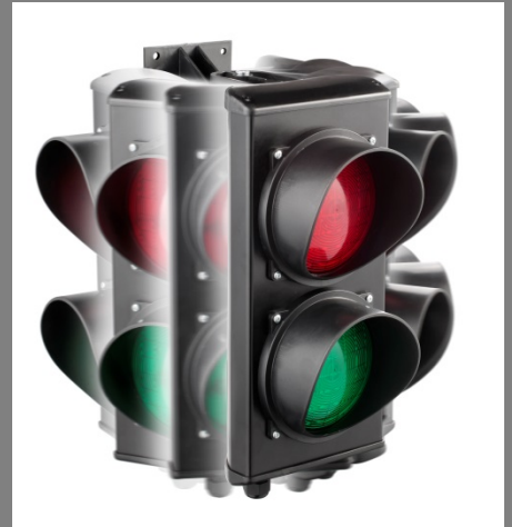
180 degree movement