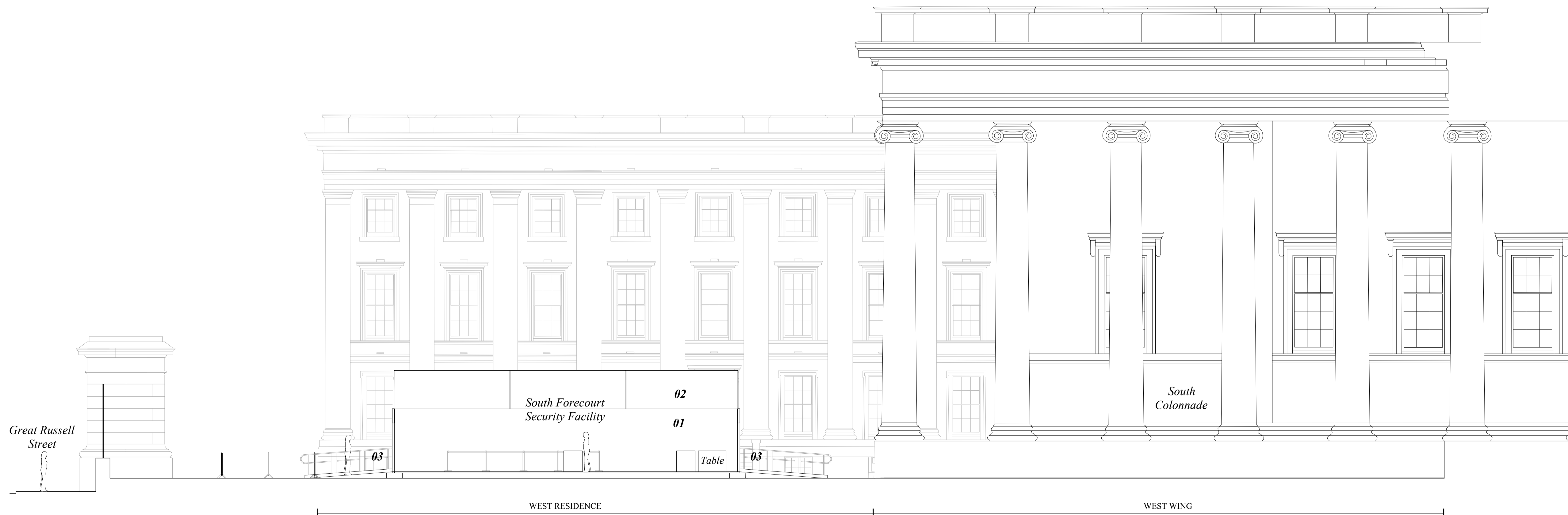
SOUTH FORECOURT SECURITY FACILITY EASTERLY SECTION 1:100