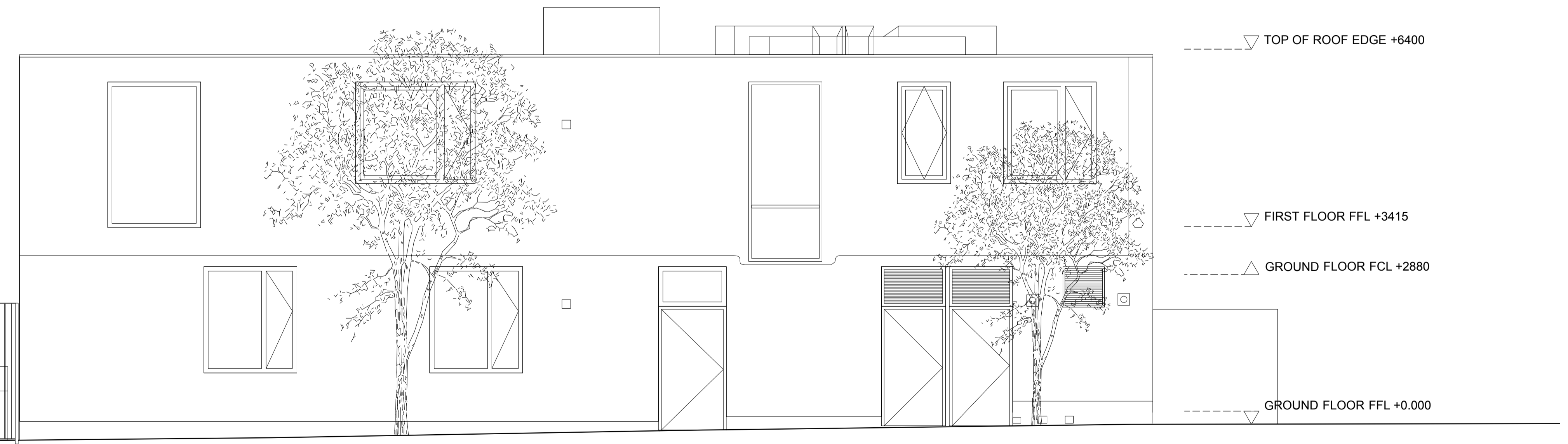
2 East Elevation Scale: 1:50