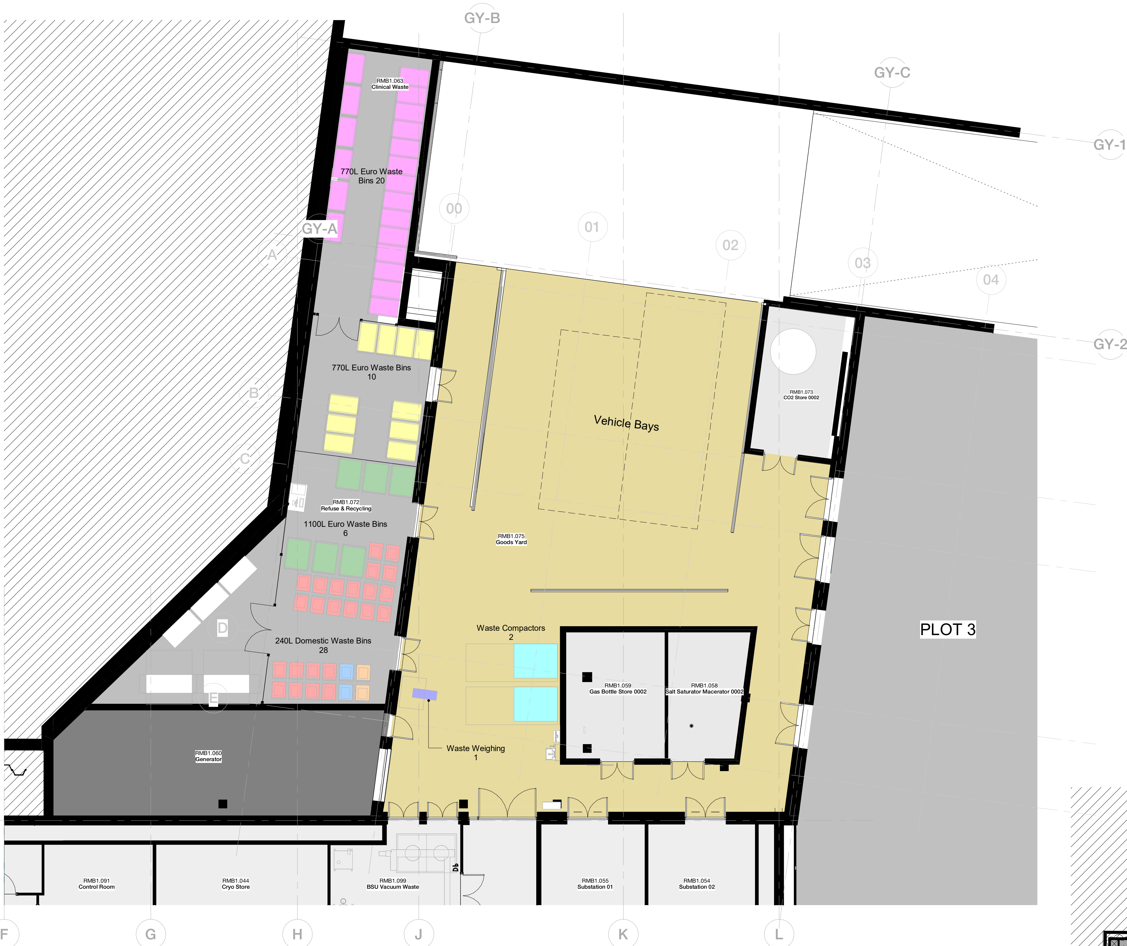
1 Goods yard and waste storage layout 1 : 100