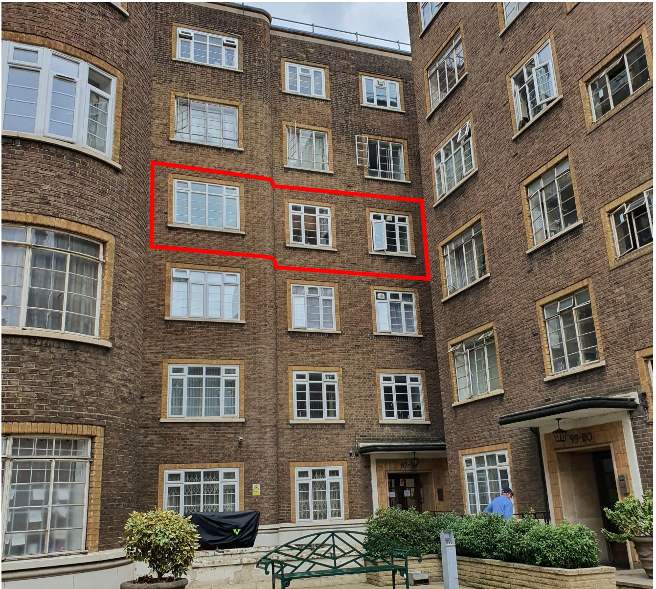
Above: Site Photo: flat no. 93 in context

The original Crittal windows to the flat have been replaced with uPVC frames.