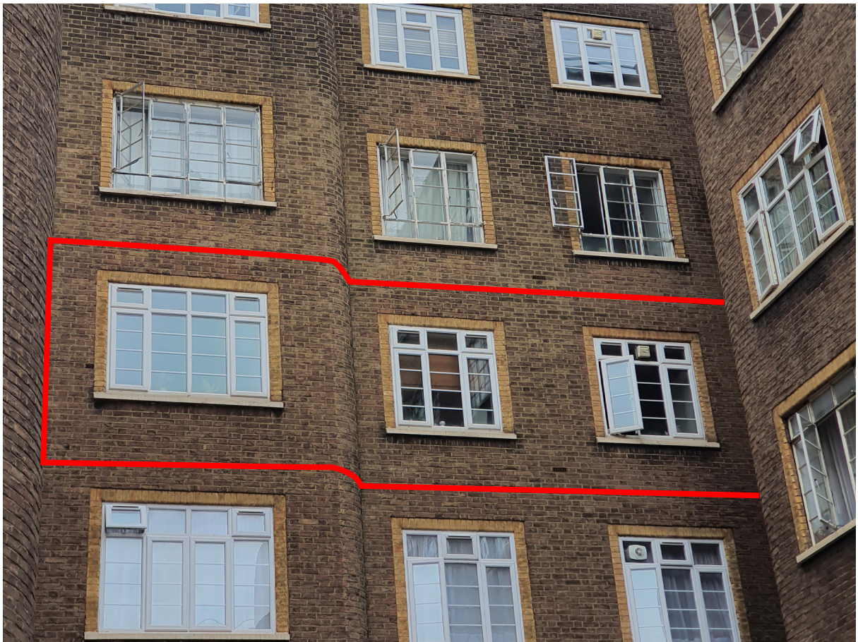
Above: Flat No. 93, courtyard-facing elevation