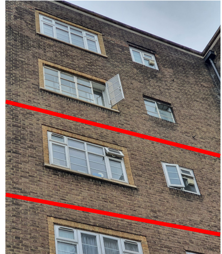
Above: Flat No. 93, Avenue Road elevation