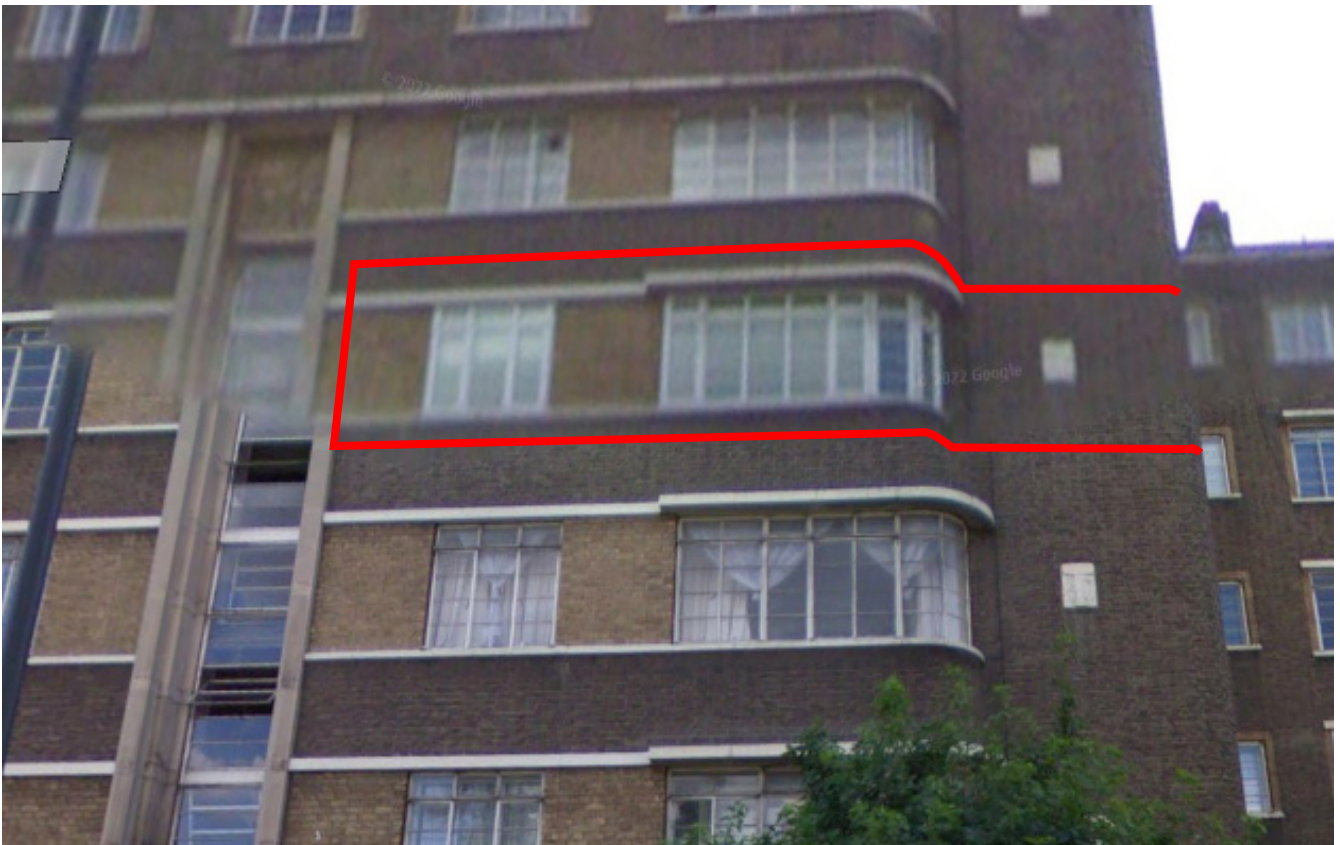
Above: Replacement uPVC windows as seen from Avenue Road, June 2008.

3. It may be the case that the replacement of the windows occurred after the property was listed in 2006. There does not appear to be records of planning or listed building consent for the windows as installed.