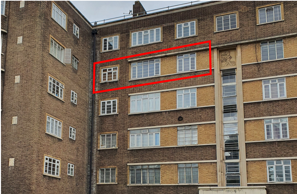
Above: Flat No. 84, Avenue Road elevation