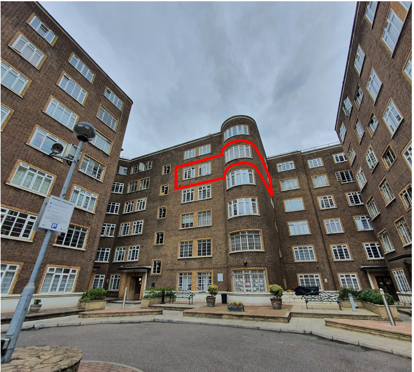
Above: Site Photo: flat no. 84 in context

The original Crittal windows to the flat have been replaced with uPVC frames.