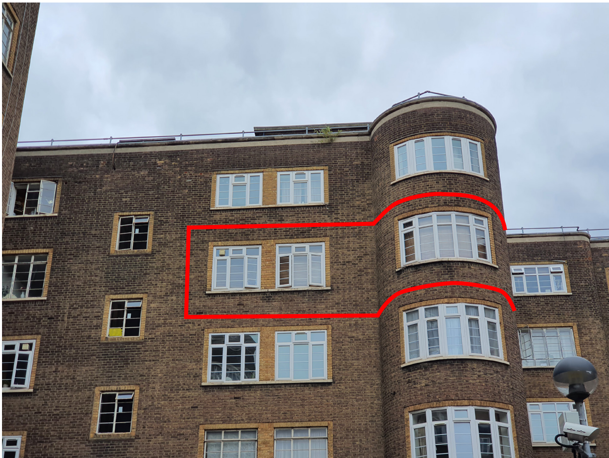
Above: Flat No. 84, courtyard-facing elevation