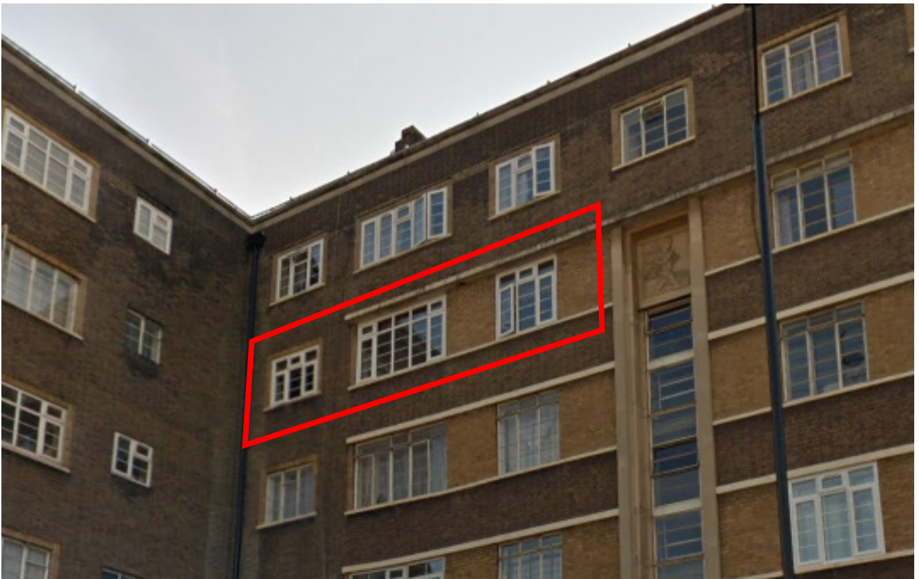
Above: Replacement uPVC windows as seen from Avenue Road, April 2012.

3. It may be the case that the replacement of the windows occurred after the property was listed in 2006. There does not appear to be records of planning or listed building consent for the windows as installed.