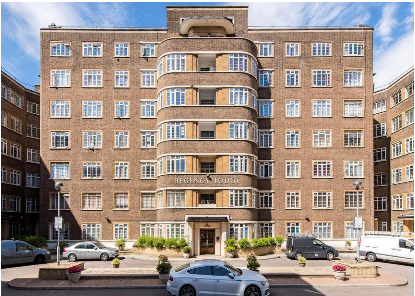
Above: Regency Lodge, main entrance

The building is organised as linked blocks in a horseshoe plan form with vehicular and pedestrian access from Adelaide Road into a landscaped forecourt.