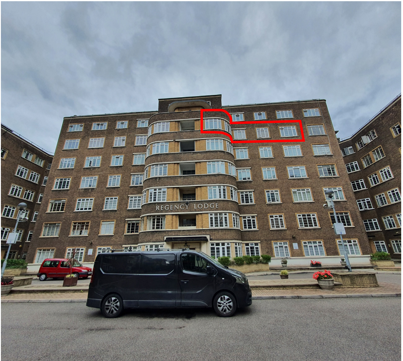
Above: Site Photo: flat no. 58 in context

The original Crittal windows to the flat have been replaced with uPVC frames.