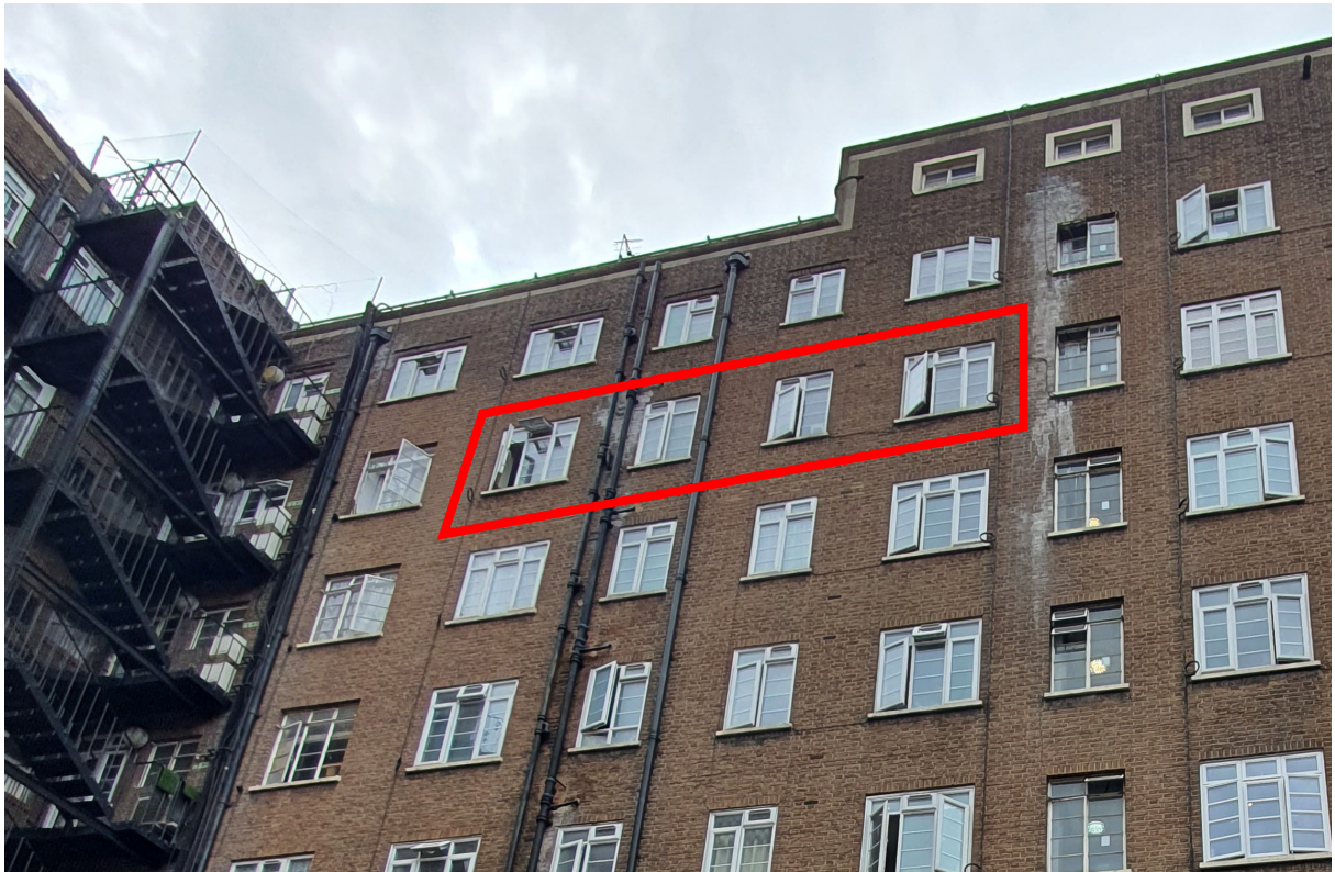
Above: Flat No. 58, North facing elevation