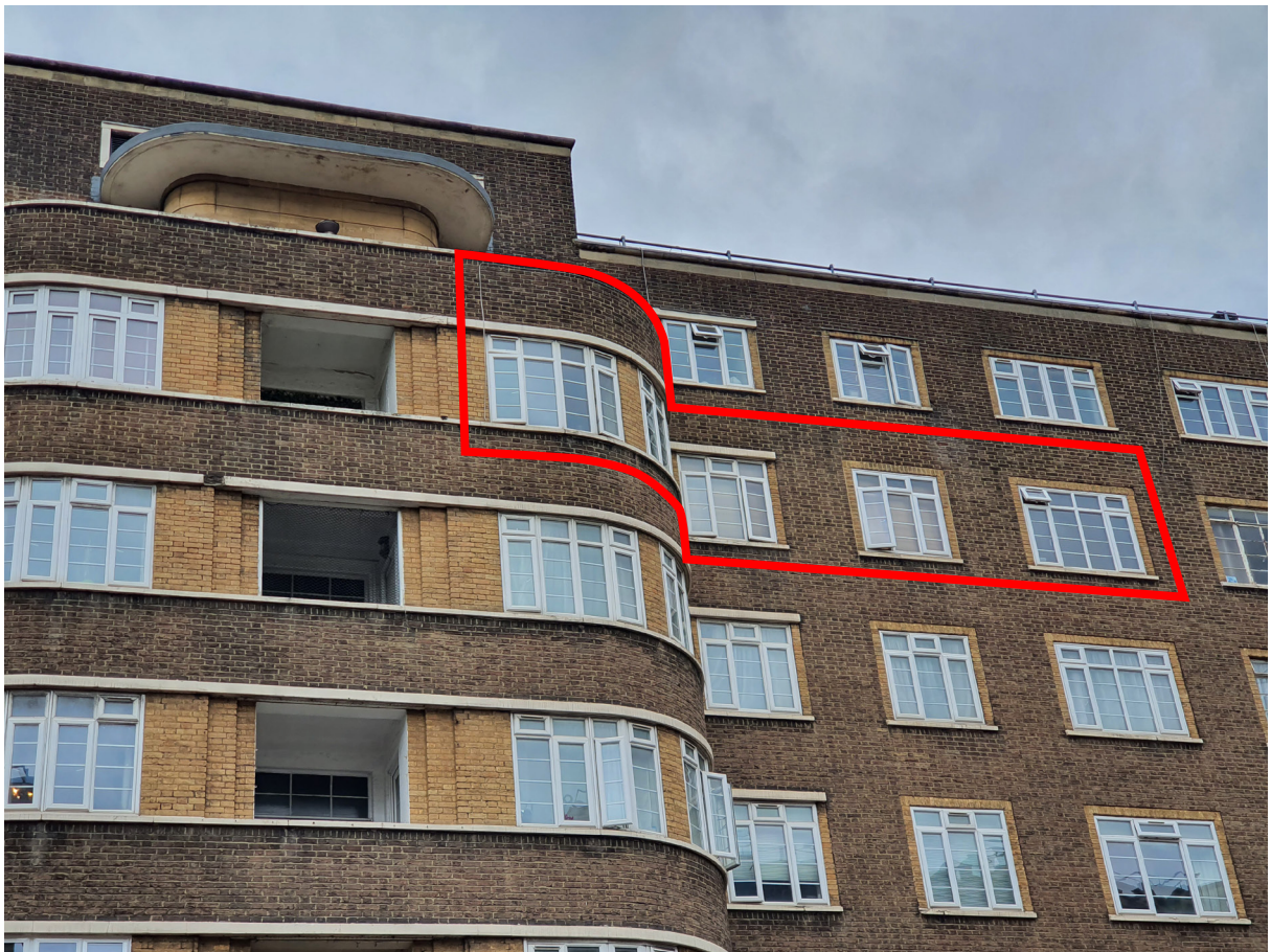
Above: Flat No. 58, courtyard-facing elevation