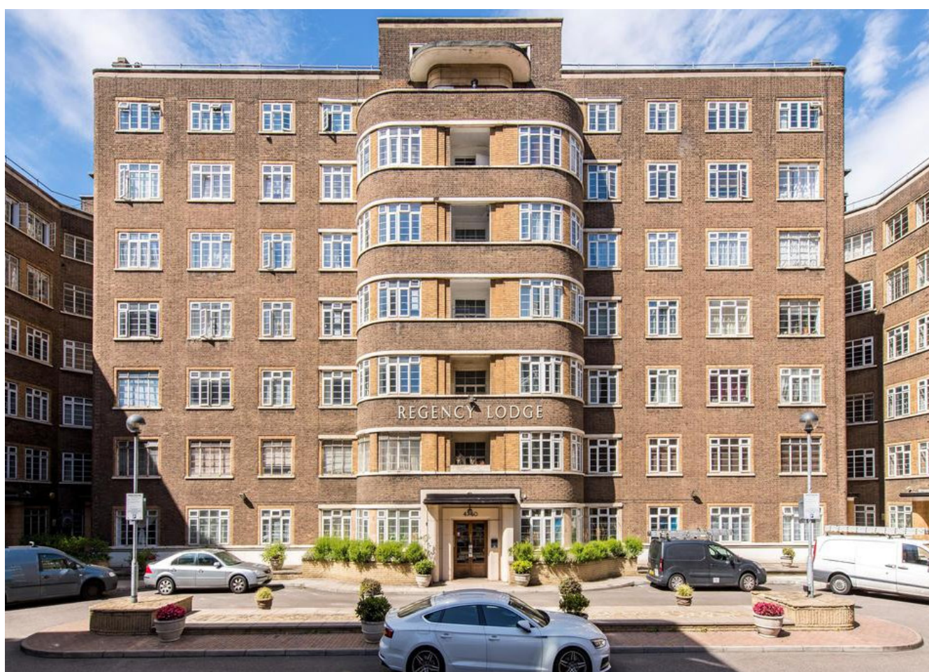
Above: Regency Lodge, main entrance

The building is organised as linked blocks in a horseshoe plan form with vehicular and pedestrian access from Adelaide Road into a landscaped forecourt.