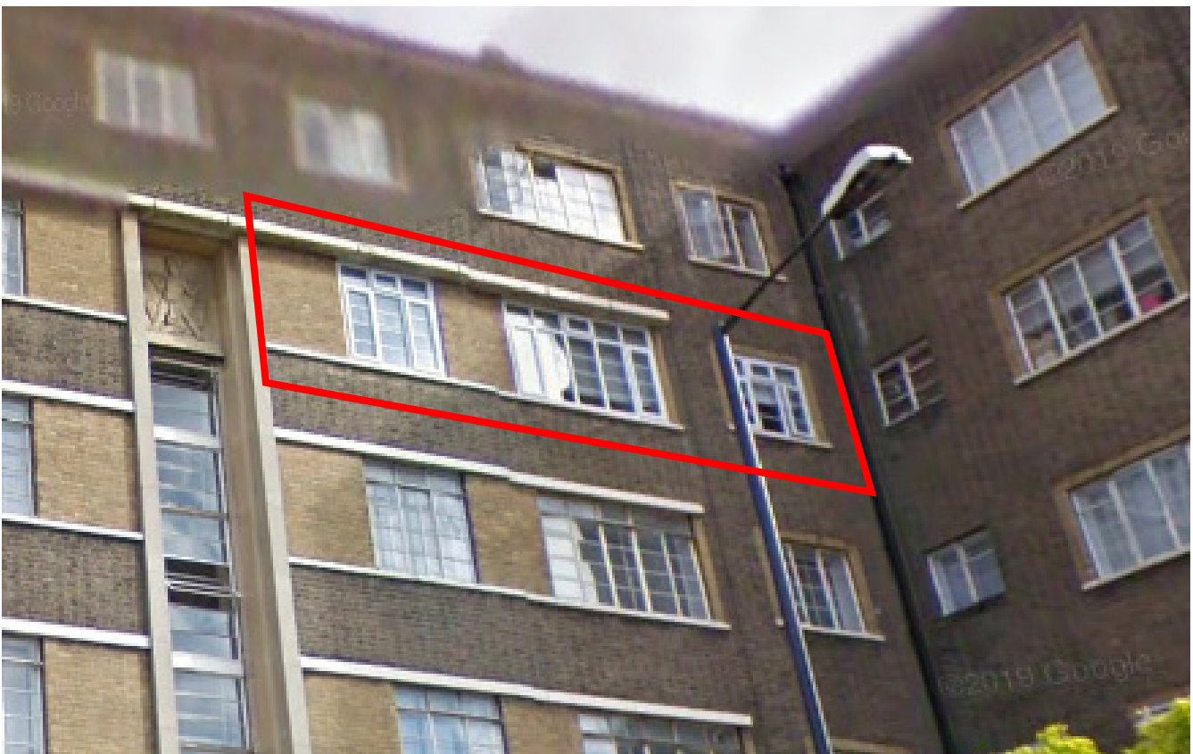
Above: Replacement uPVC windows as seen from Finchley Road, June 2009.

3. It may be the case that the replacement of the windows occurred after the property was listed in 2006. There does not appear to be records of planning or listed building consent for the windows as installed.