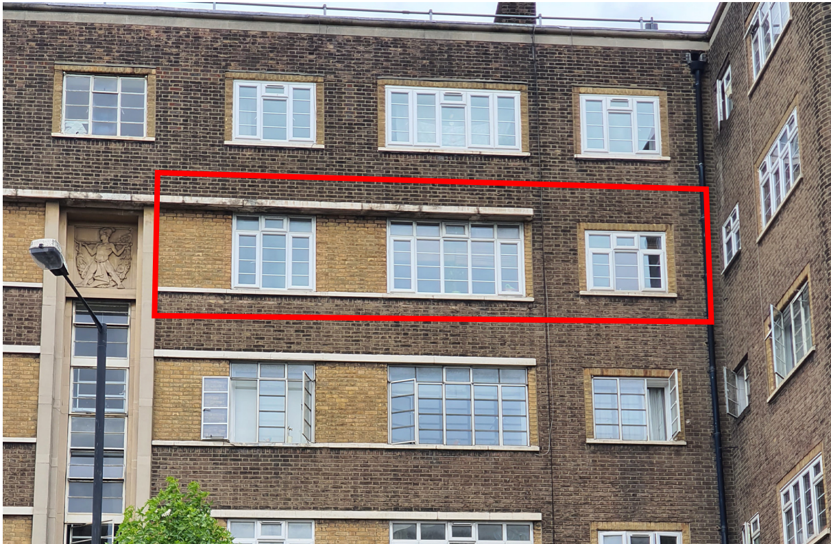
Above: Flat No. 31, Finchley Road elevation