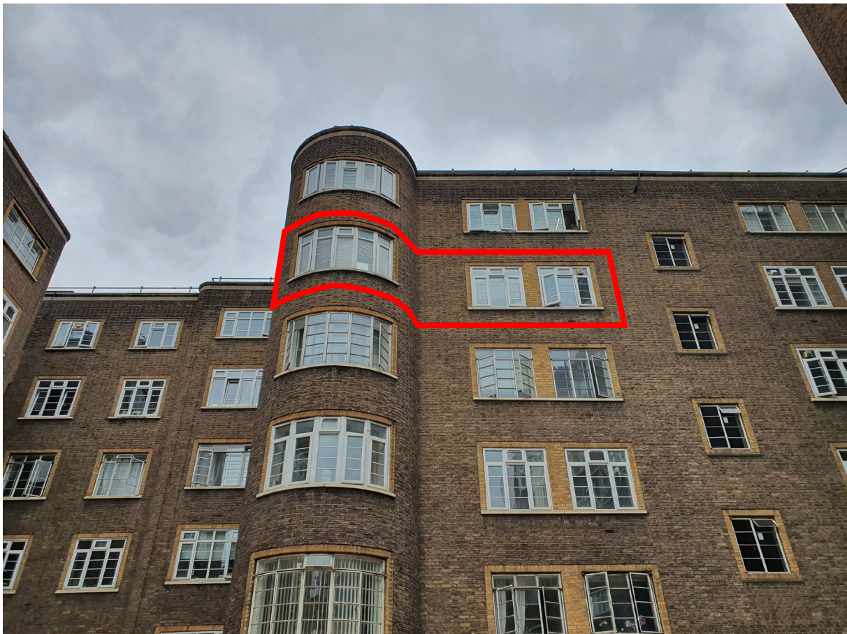
Above: Flat No. 31, courtyard-facing elevation