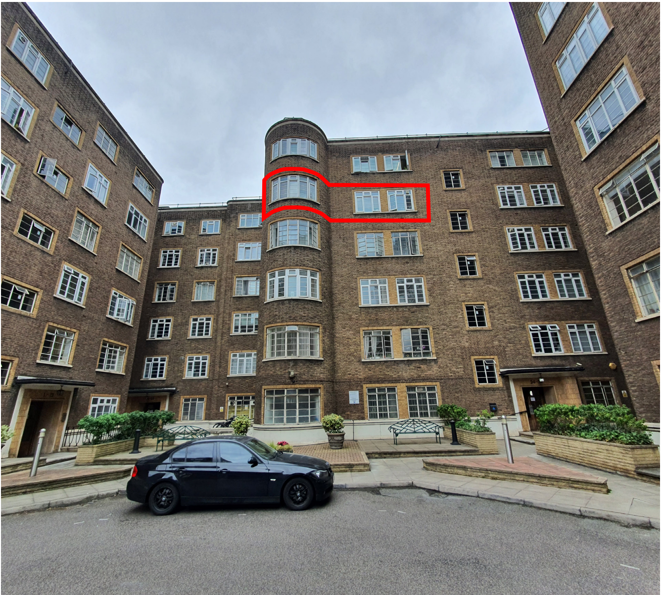
Above: Site Photo: flat no. 31 in context

The original Crittal windows to the flat have been replaced with uPVC frames.