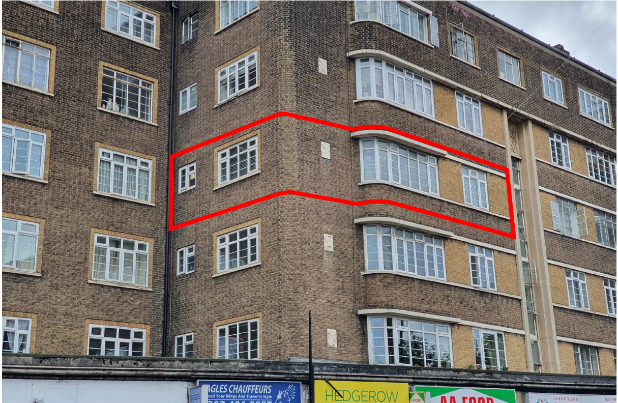
Above: Flat No. 28, Finchley Road elevation