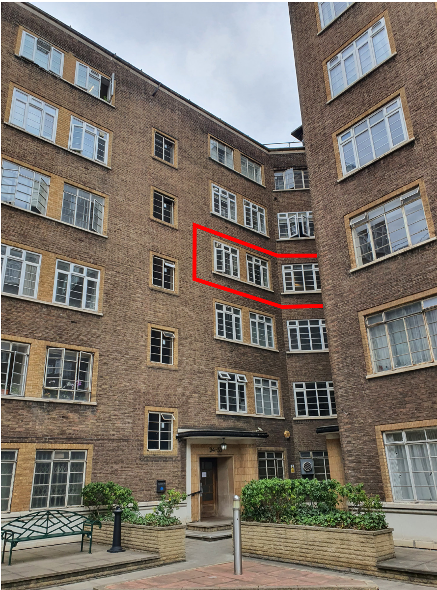
Above: Site Photo: flat no. 28 in context

The original Crittal windows to the flat have been replaced with uPVC frames.