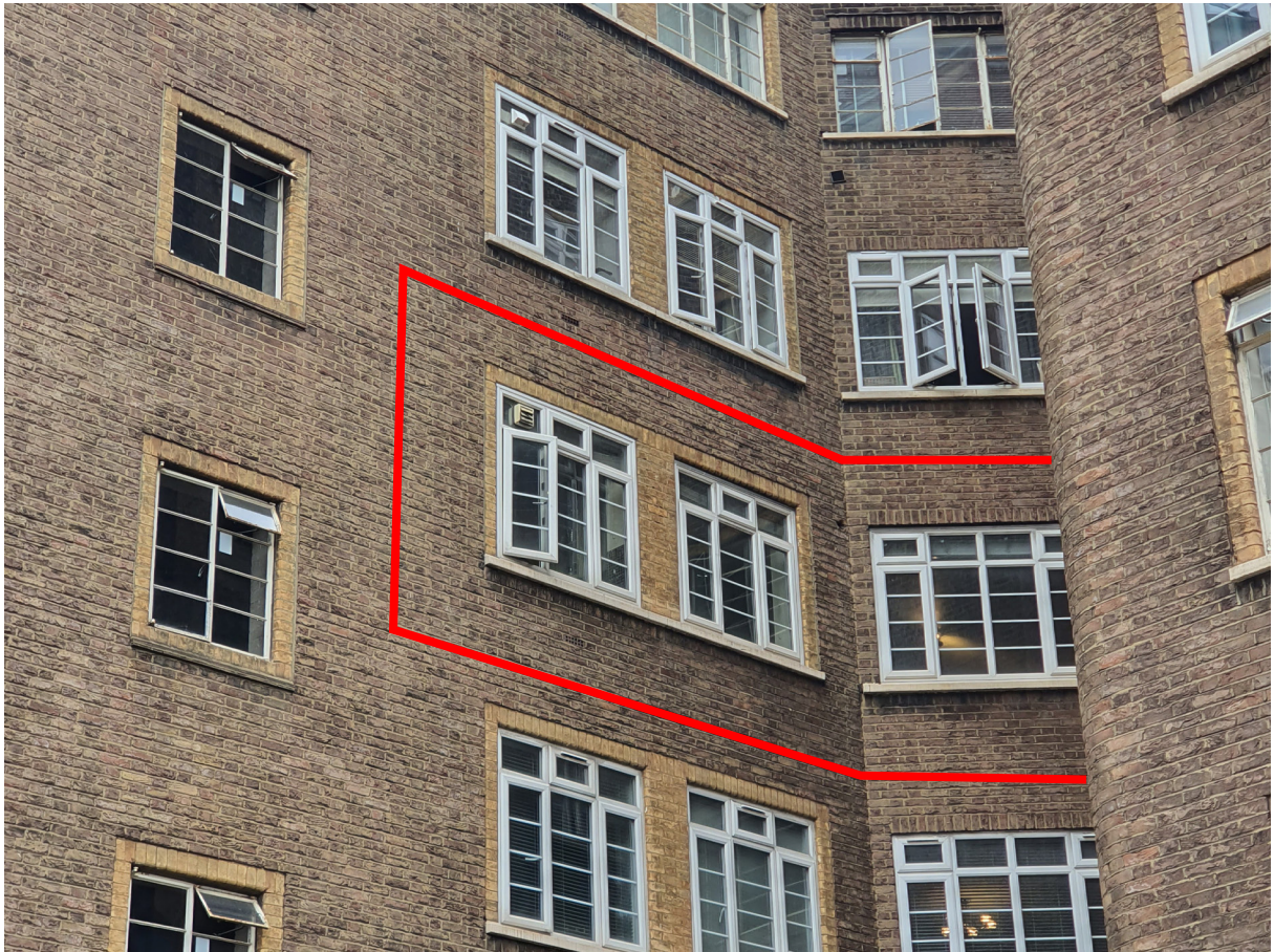
Above: Flat No. 28, courtyard-facing elevation