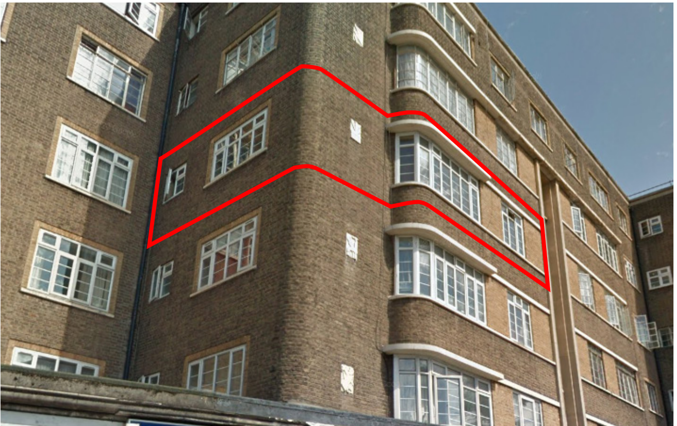
Above: Replacement uPVC windows as seen from Finchley Road, June 2012.

3. It may be the case that the replacement of the windows occurred after the property was listed in 2006. There does not appear to be records of planning or listed building consent for the windows as installed.