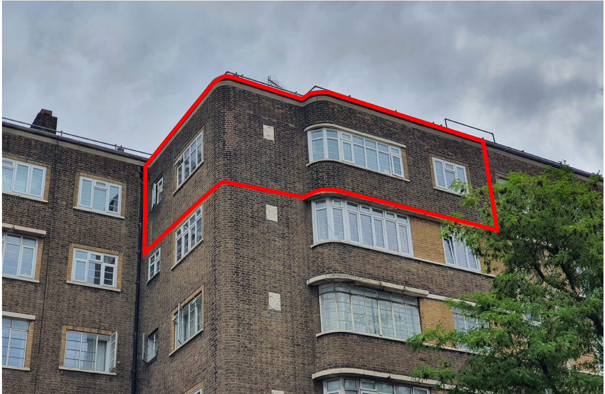
Above: Flat No. 22, Finchley Road elevation