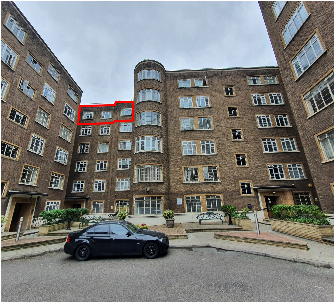
Above: Site Photo: flat no. 22 in context

The original Crittal windows to the flat have been replaced with uPVC frames.