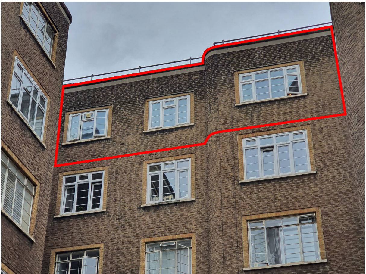
Above: Flat No. 22, courtyard-facing elevation