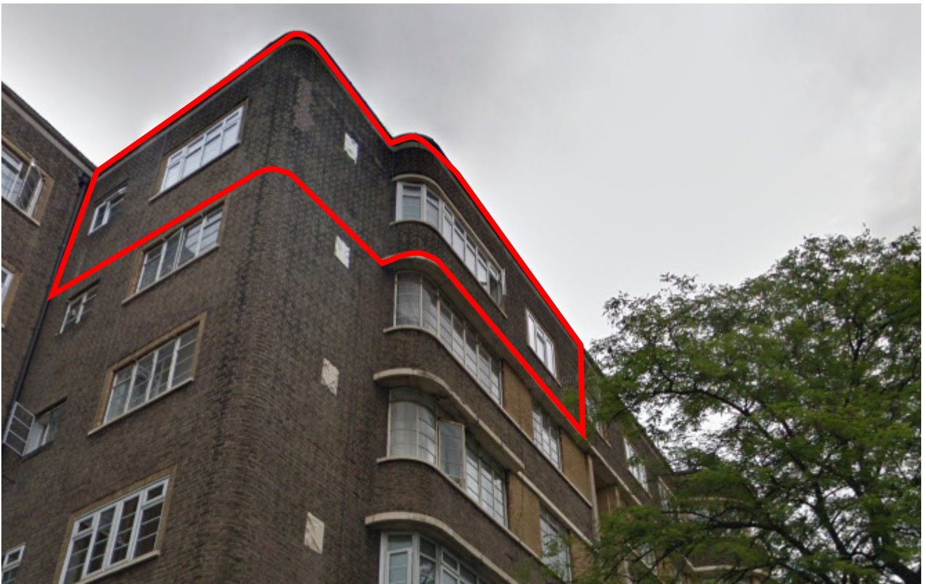
Above: Replacement uPVC windows as seen from Finchley Road, July 2012.

3. It may be the case that the replacement of the windows occurred after the property was listed in 2006. There does not appear to be records of planning or listed building consent for the windows as installed.