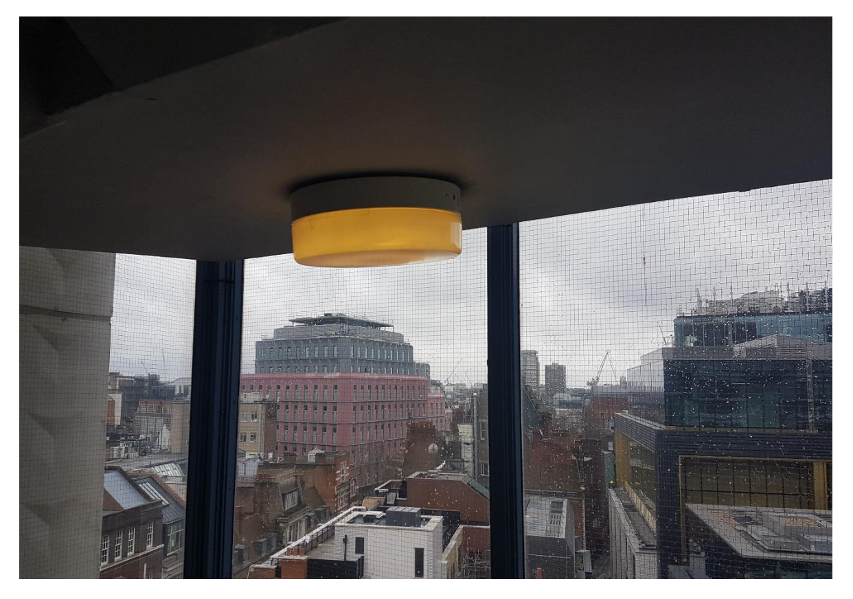
Photograph 9: Example of existing 2D bulkhead light fitting throughout staircases

HA/9261 Page 17 of 12 July 2022 – Revision 1