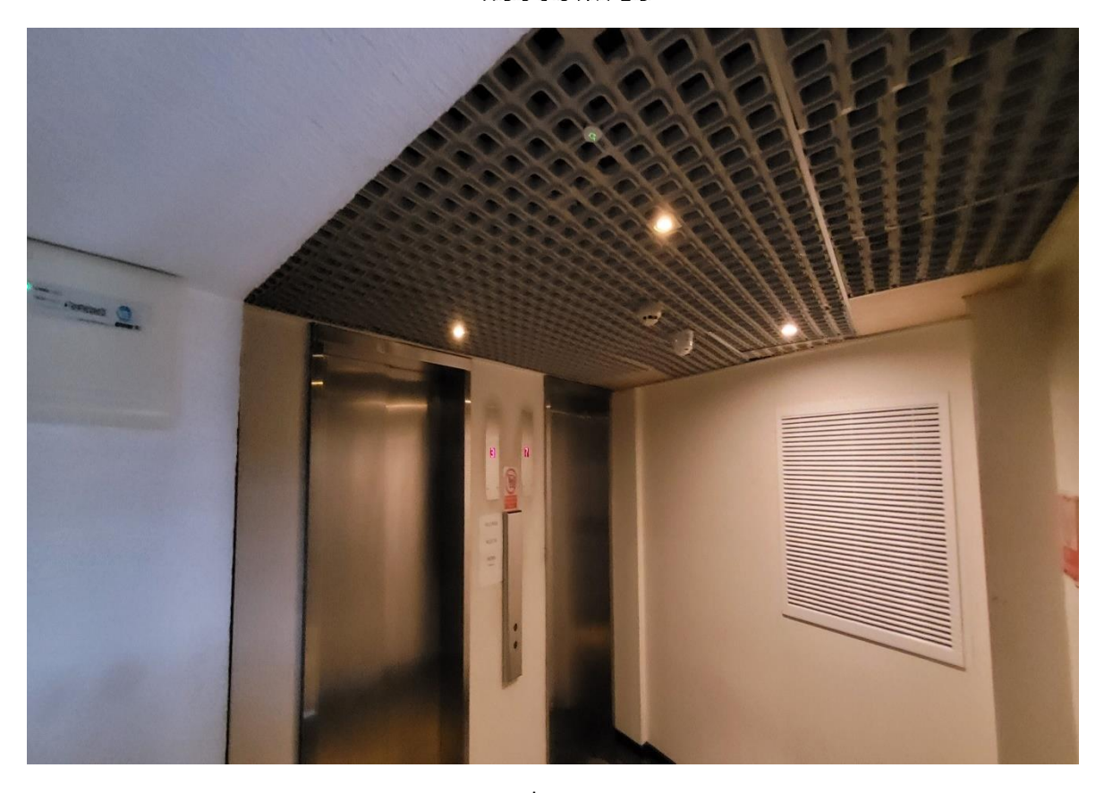
Photograph 1: Typical plywood sheeting to 3<sup>rd</sup> floor lift lobby ceiling where ceiling tiles missing