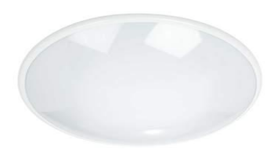
Photograph 8: Proposed Tamlite Elegance combined emergency light fitting for corridors and lift lobbies