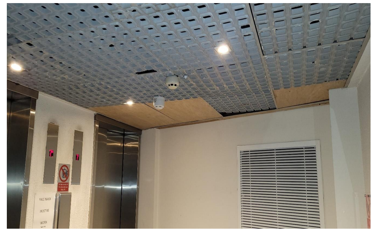
Photograph 2: Typical plywood sheeting to 7<sup>th</sup> floor lift lobby ceiling where ceiling tiles missing