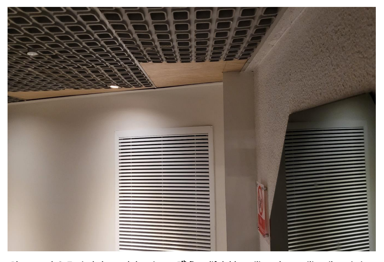
Photograph 3: Typical plywood sheeting to 5<sup>th</sup> floor lift lobby ceiling where ceiling tiles missing