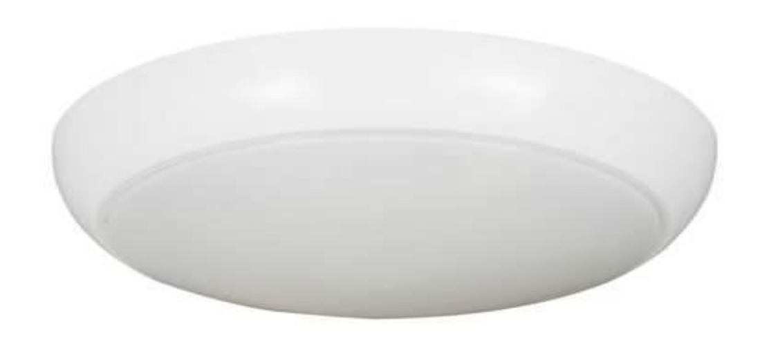
Photograph 10: Proposed Tamlite Lunar combined emergency light fitting for staircases