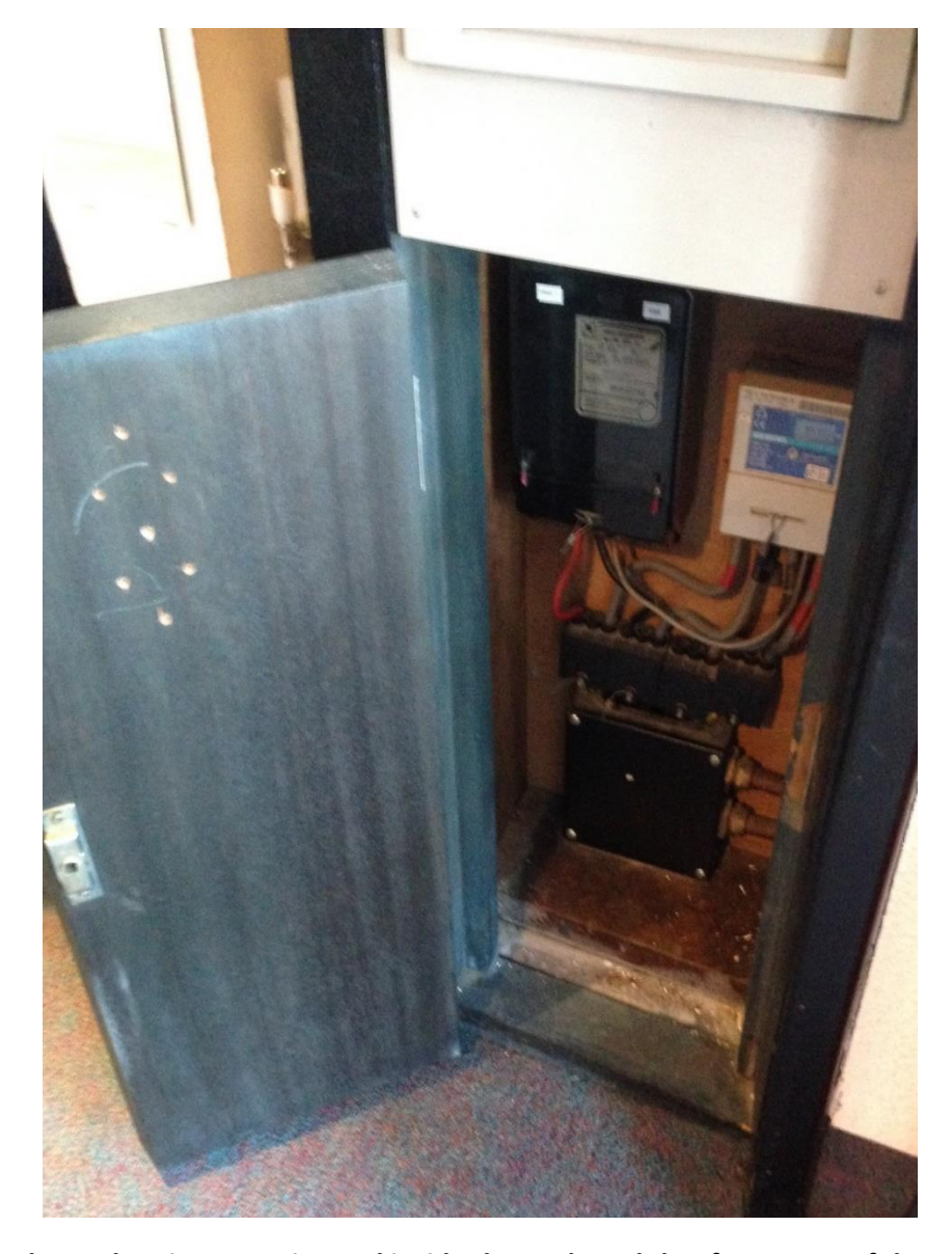
Photograph 11: Electric meter situated inside the cupboard that forms part of the apartment front entrance doorset.