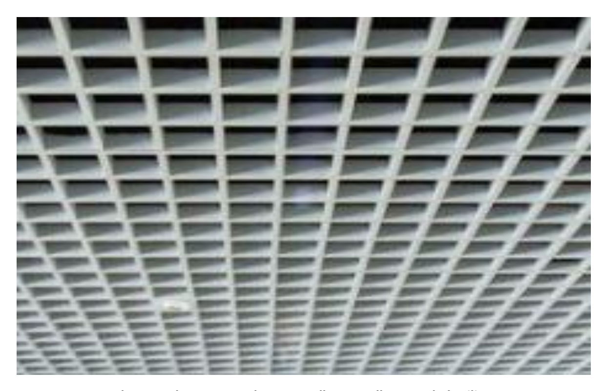
Photograph 6: Proposed SAS Trucell open cell suspended ceiling