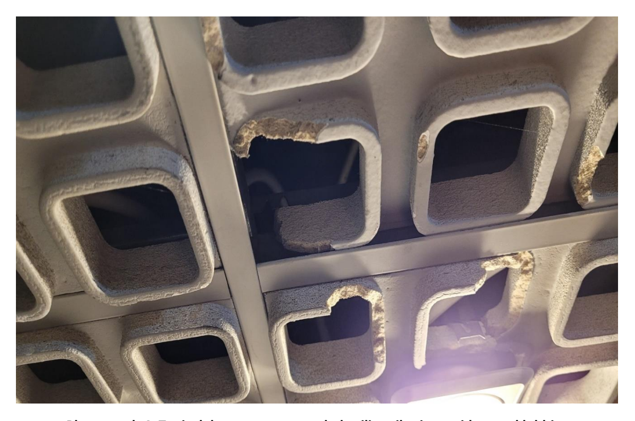
Photograph 4: Typical damage to suspended ceiling tiles in corridors and lobbies