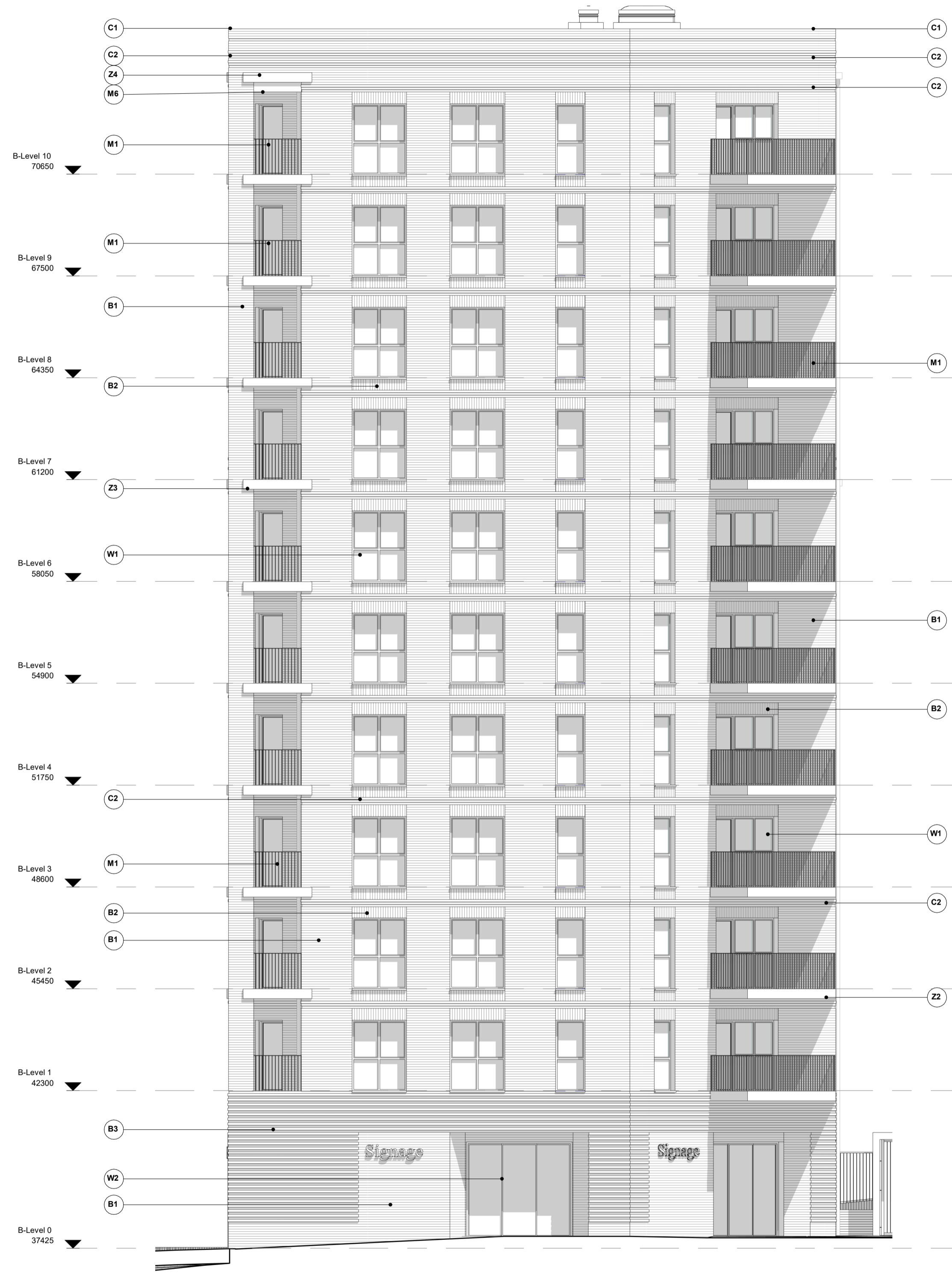
1 Block B - East Side Elevation Scale: 1:100