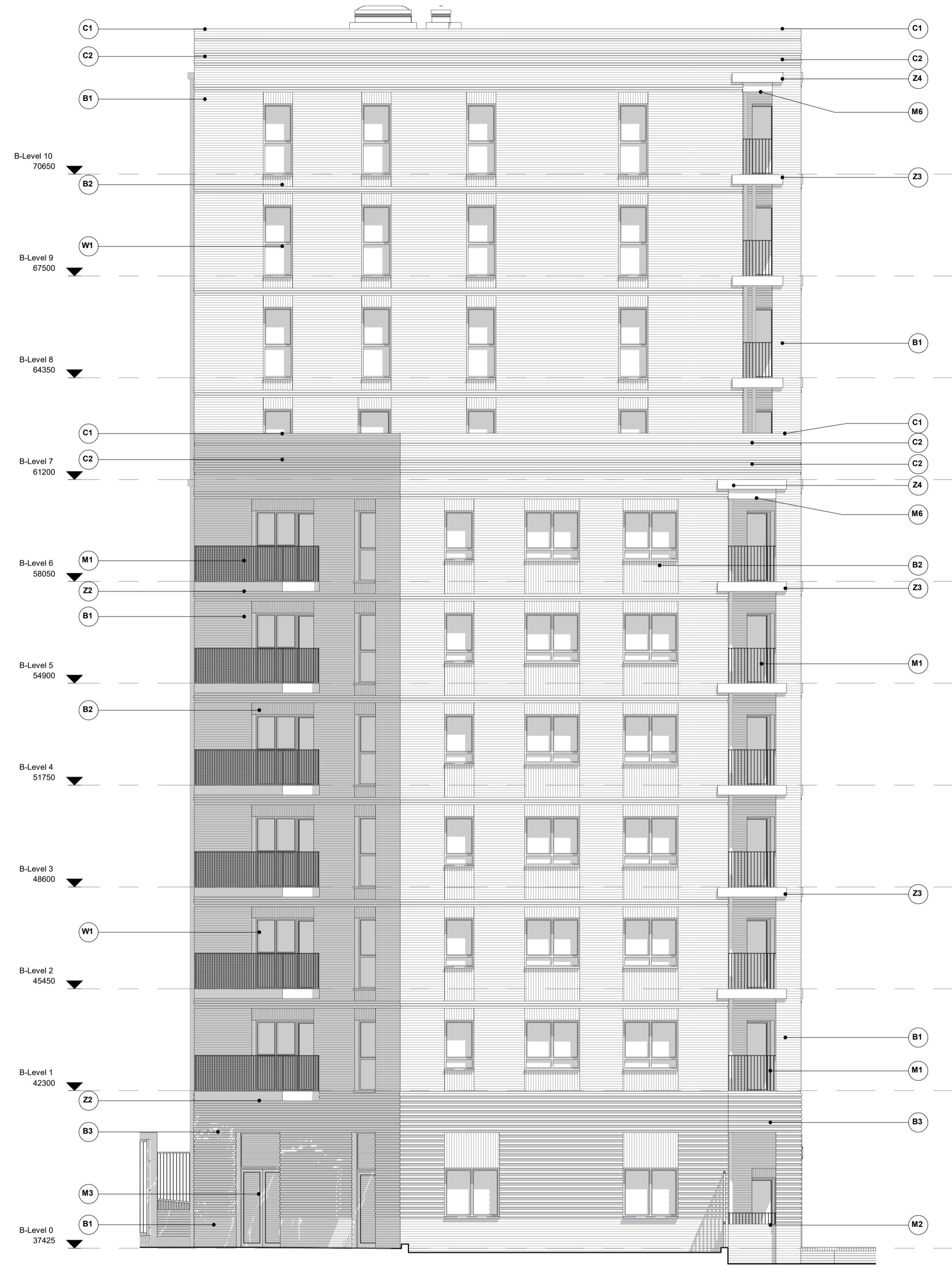
2 Block B - West Side Elevation Scale: 1:100