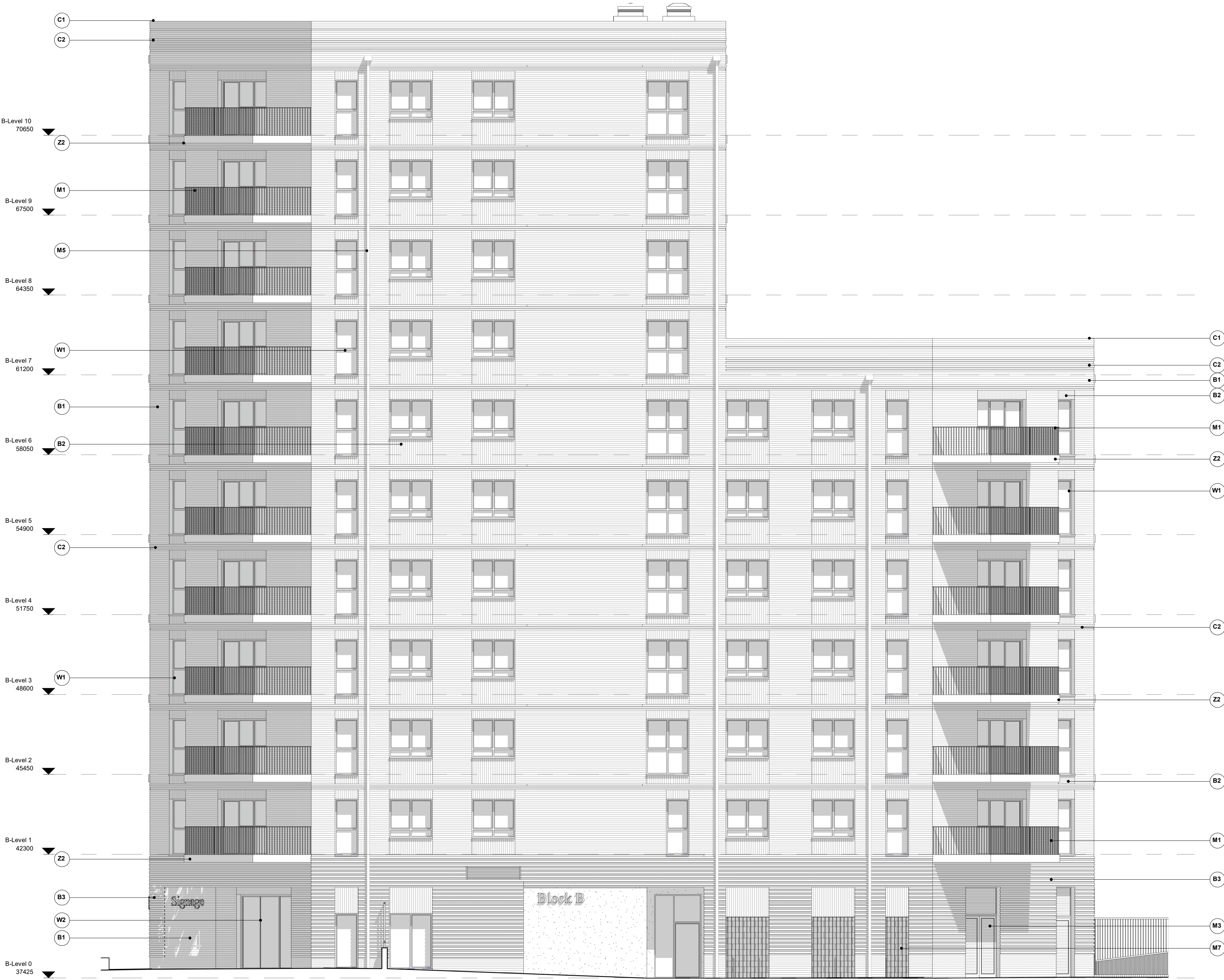
Block B - Rear Elevation