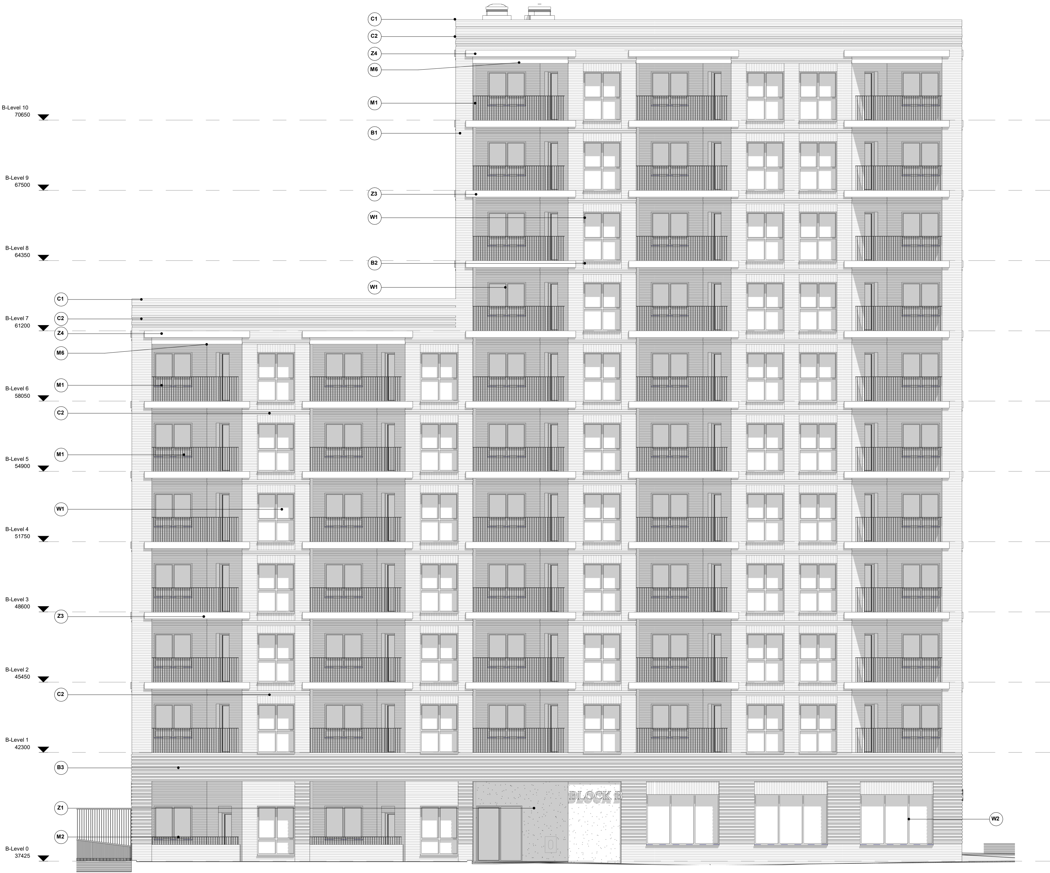
1 Block B - Front Elevation Scale: 1:100