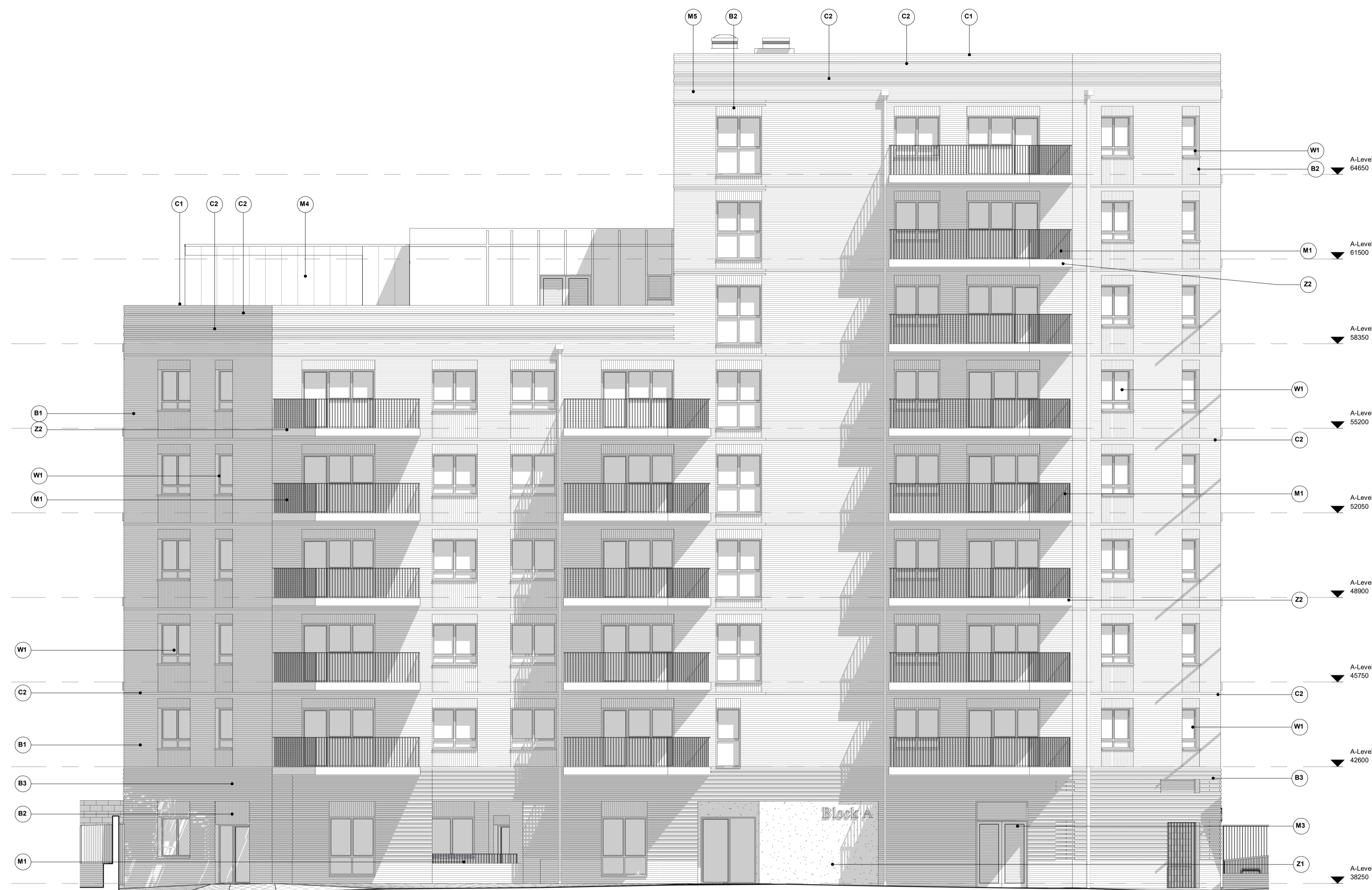
1 Block A - Rear Elevation Scale: 1:100