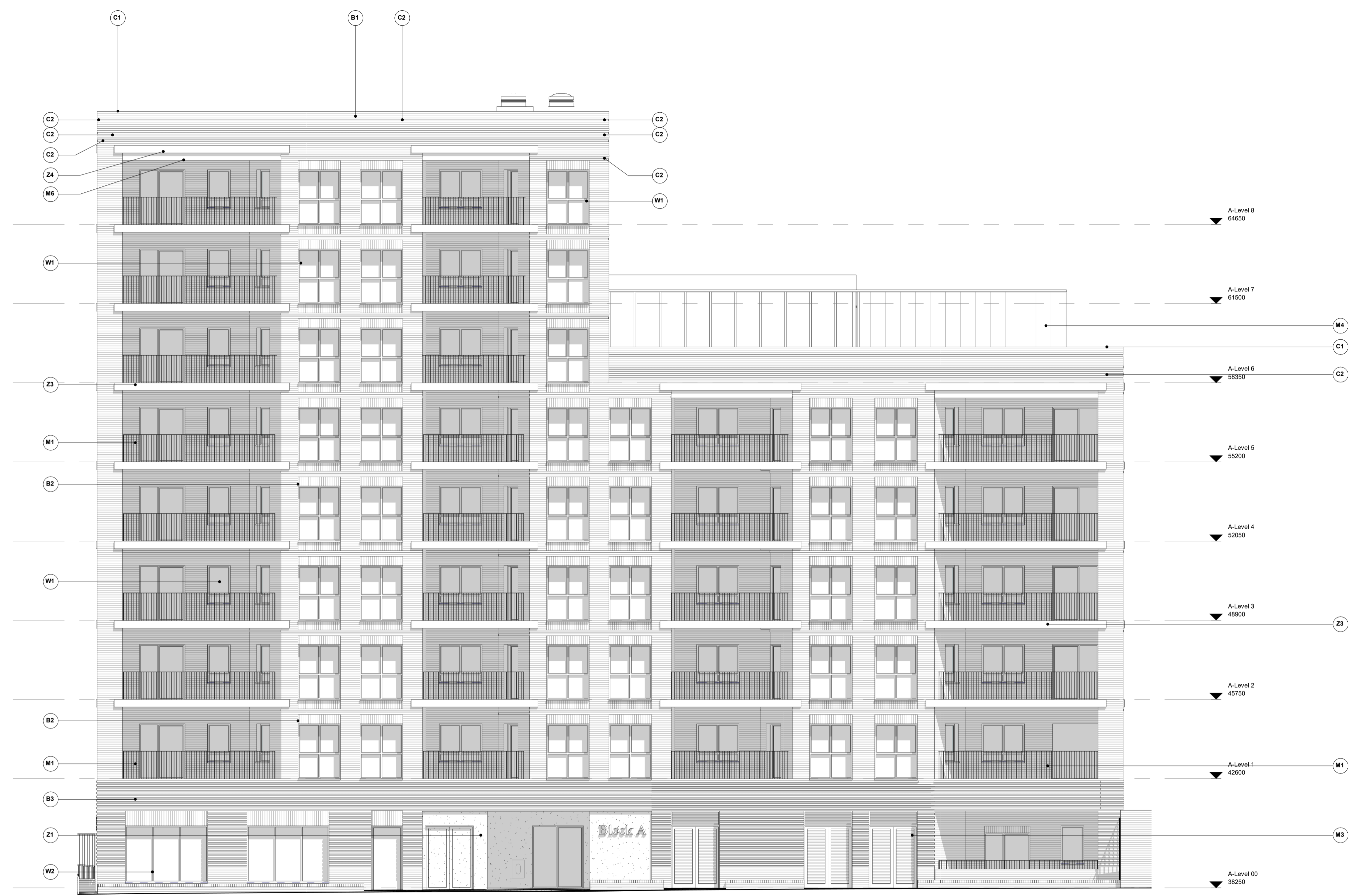
1 Block A - Front Elevation Scale: 1:100