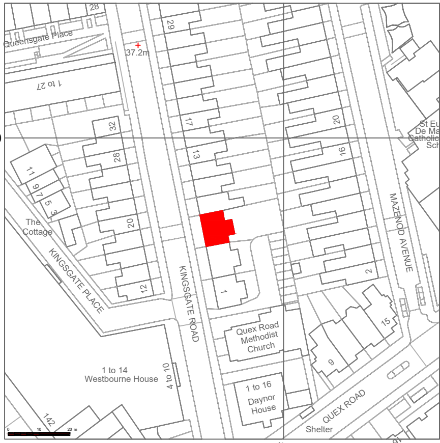
SL SITE LOCATION PLAN Scale: 1:1250