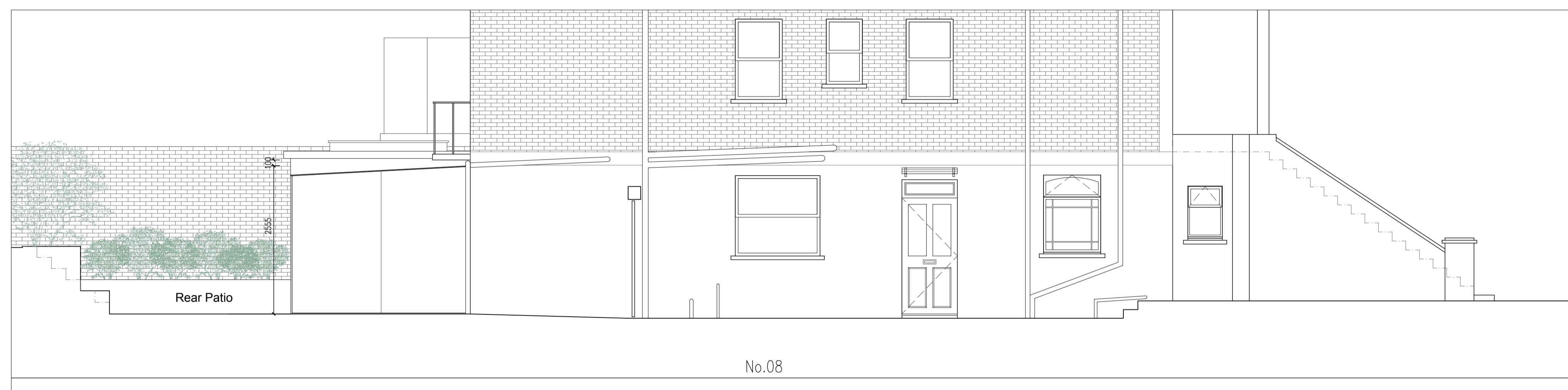
Proposed South West | Side Elevation (lower ground level only) Scale 1:100 @ A3 | 1:50 @ A1