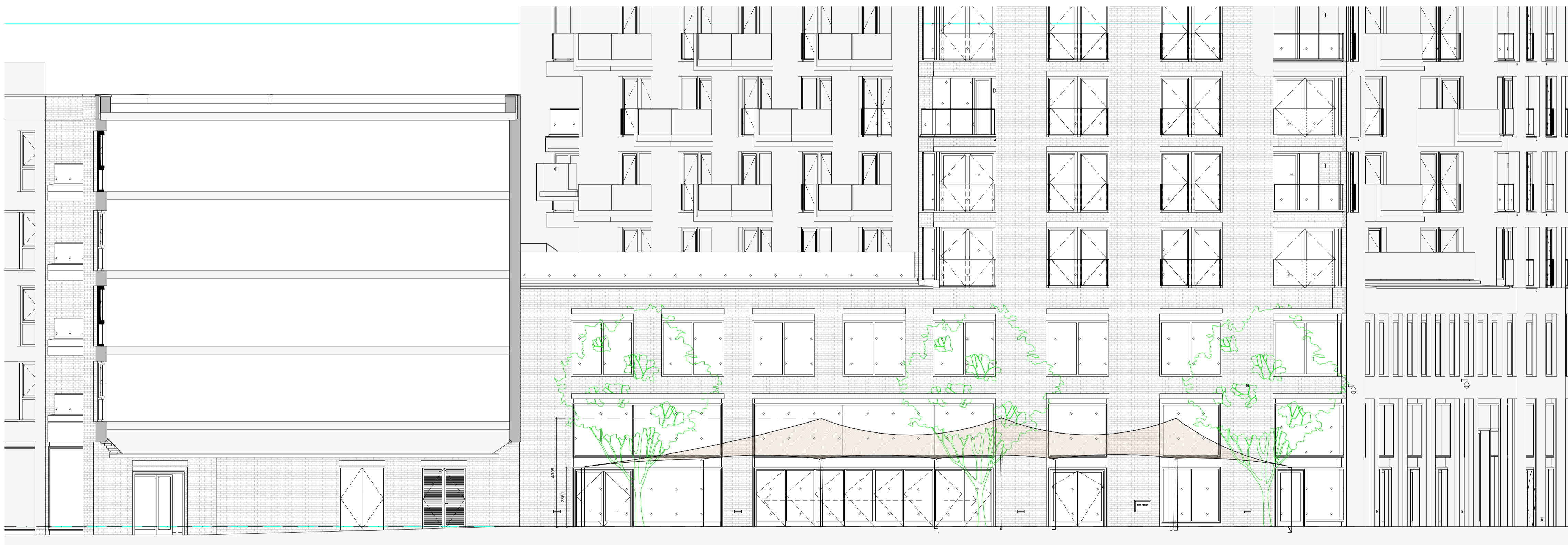
02 ELEVATION B-B SCALE 1:100 @ A1