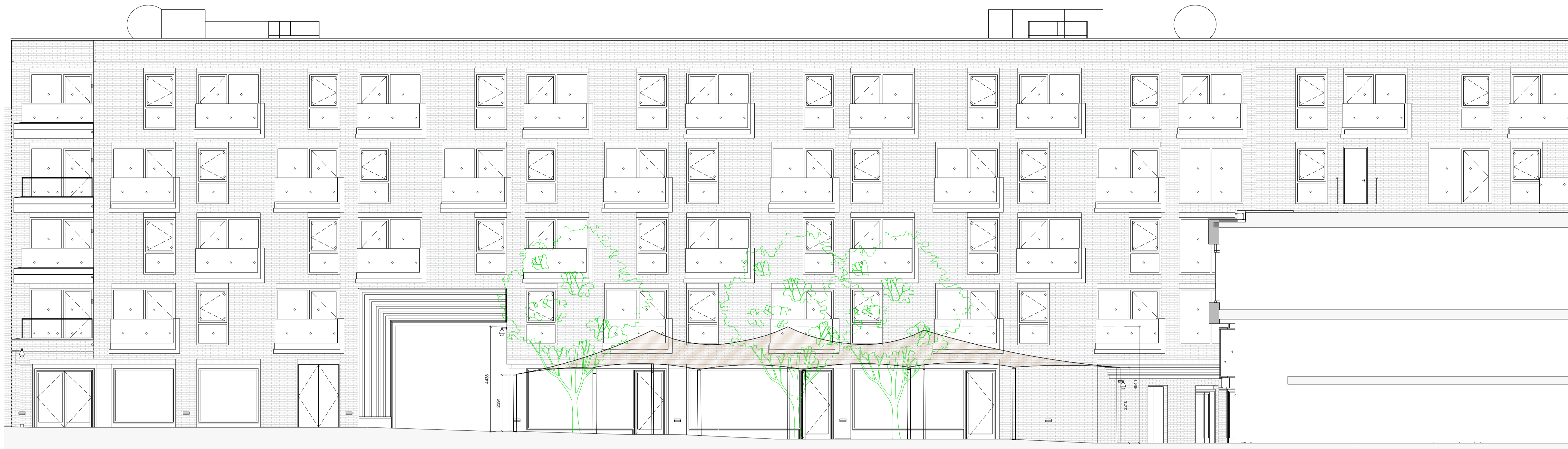
01 ELEVATION A-A SCALE 1:100 @ A1