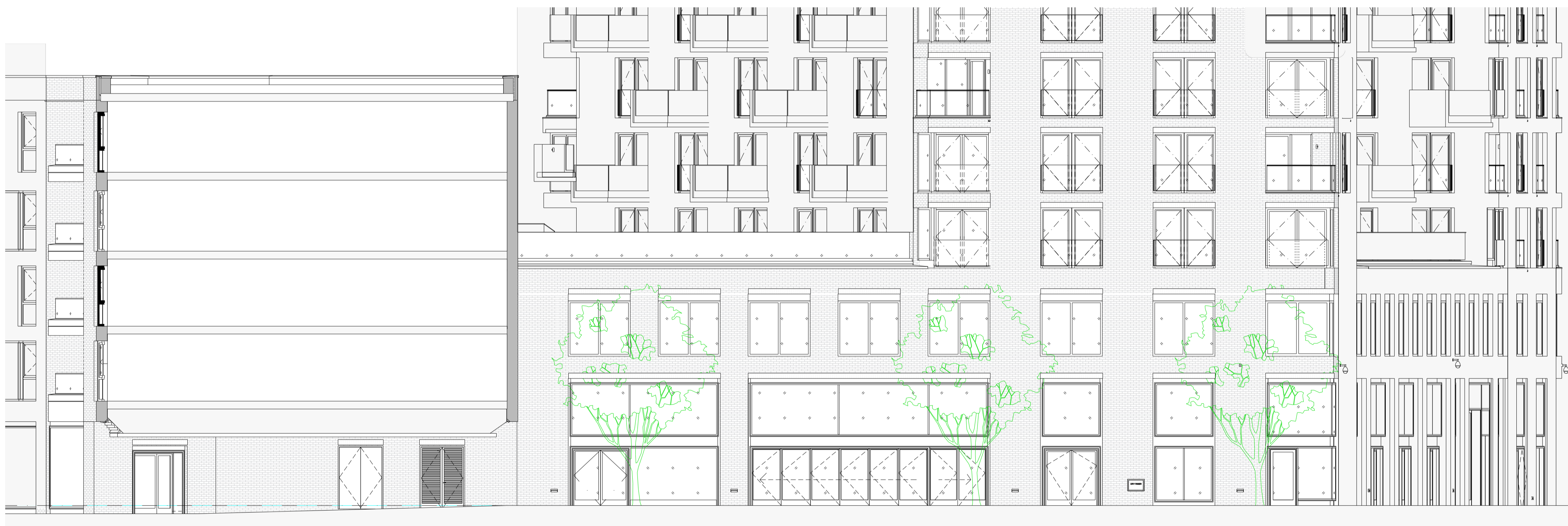
02 ELEVATION B-B SCALE 1:100 @ A1