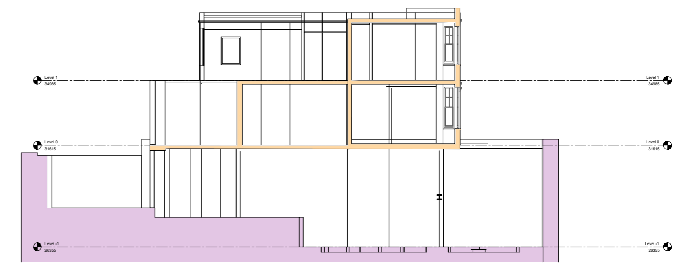
UNDER CONSTRUCTION SECTION