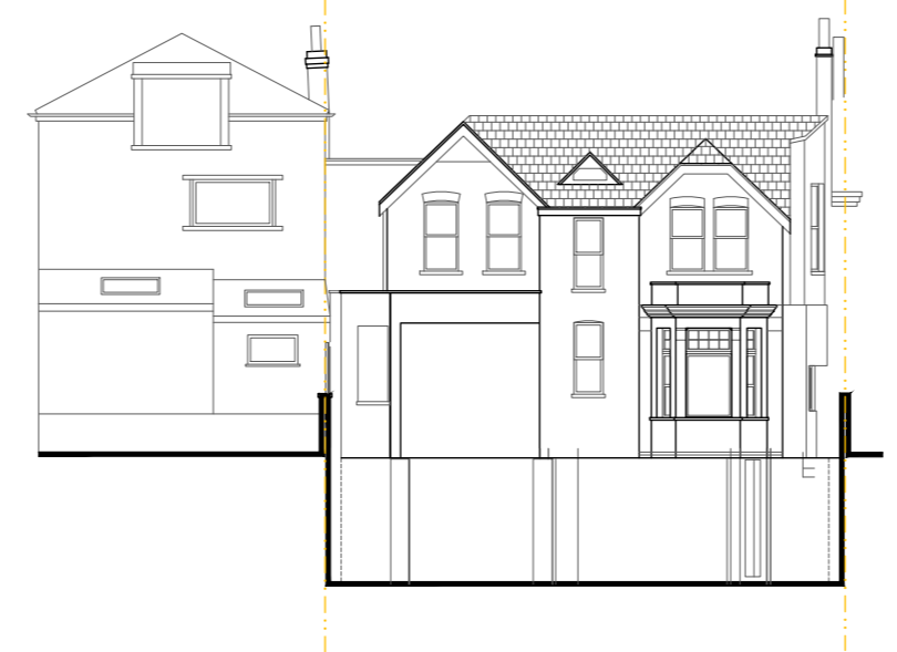
UNDER CONSTRUCTION - REAR ELEVATION