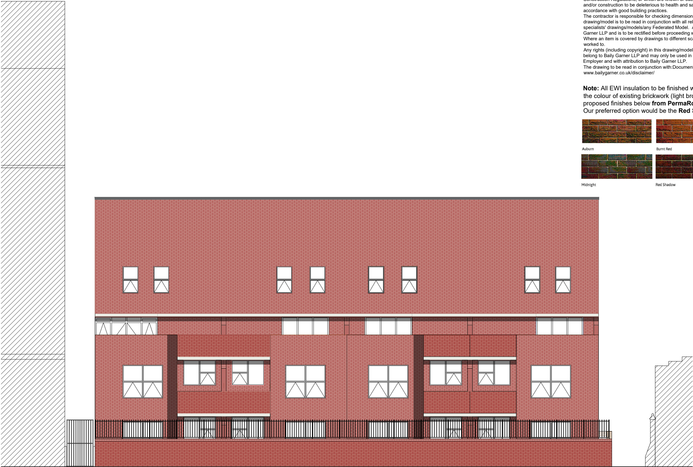
PROPOSED FRONT STREET SCENE: 1:100