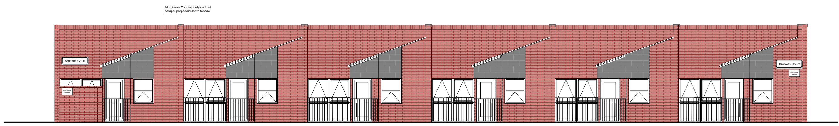
PROPOSED FRONT STREET SCENE 7 - 12 BROOKES COURT: 1:100