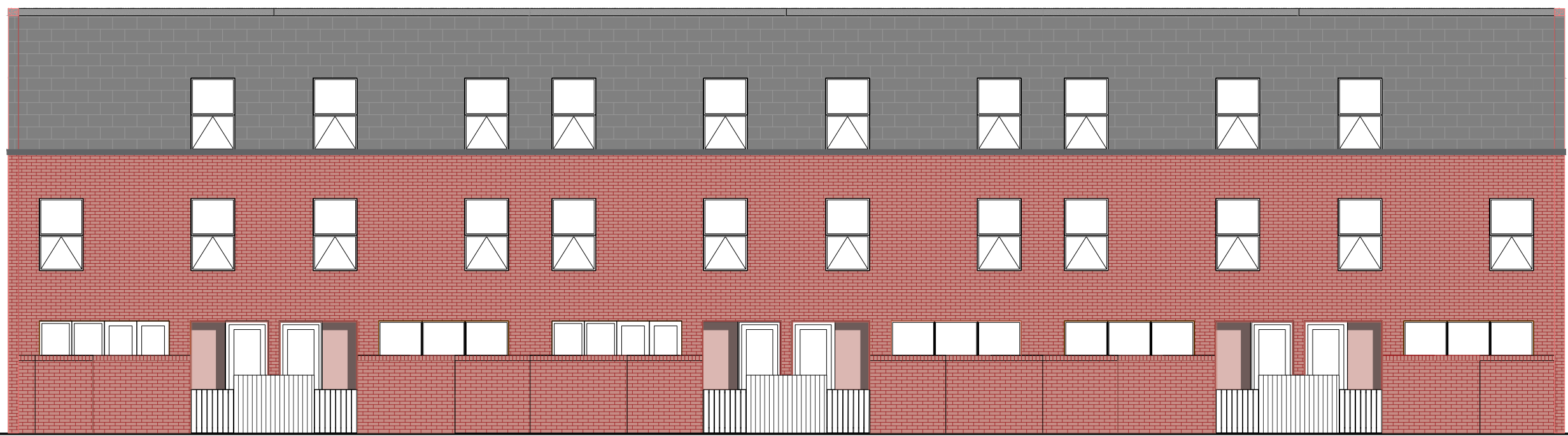
PROPOSED FRONT STREET SCENE: 1:100