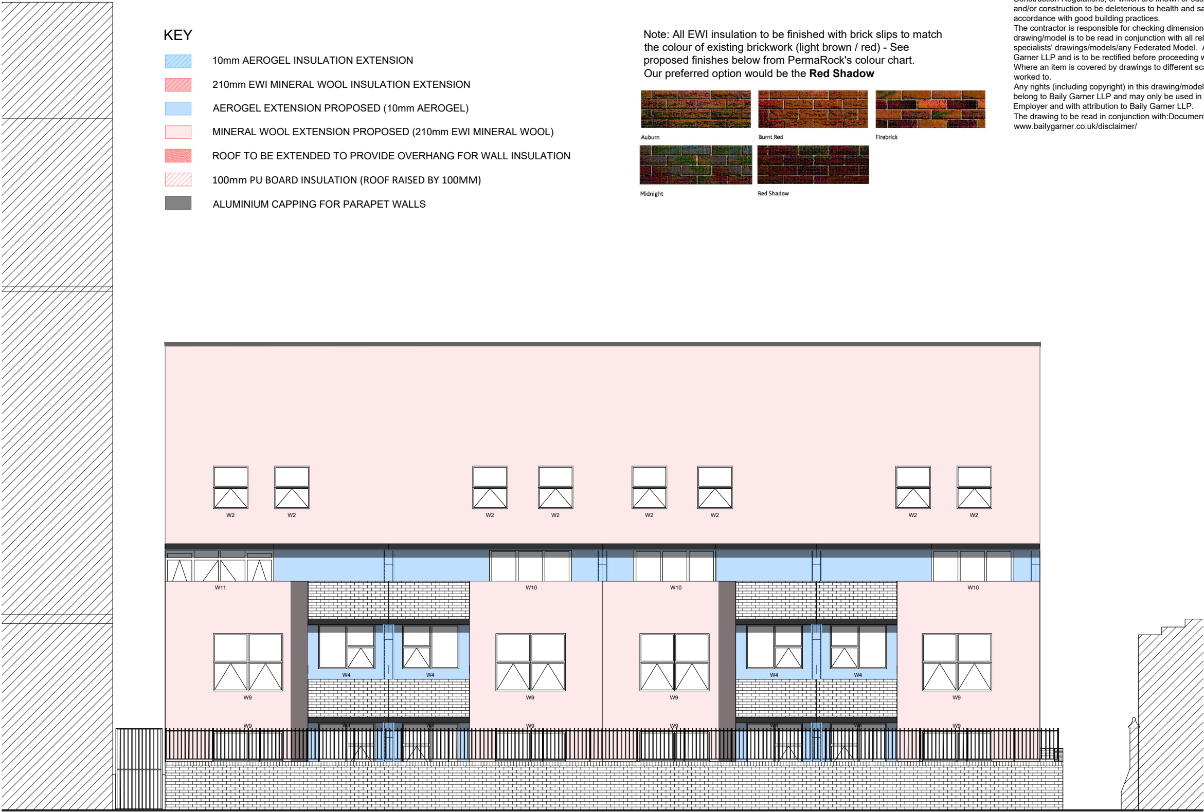
PROPOSED FRONT STREET SCENE: 1:100