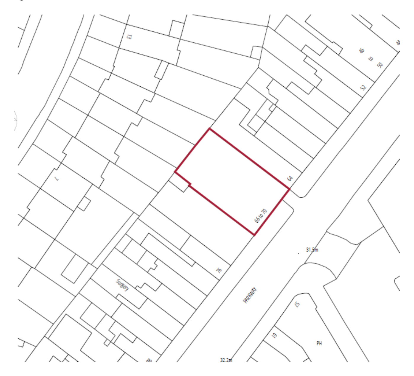
Fig 1: Site Location and Block Plan

This proposal is for the permitted development from offices (use class E) to two residential units (C3 use) on the first and second floor.