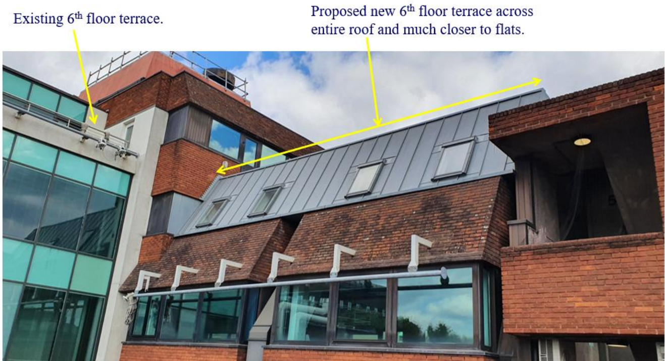
View from back of flats, across to existing and proposed 6 th floor terraces.

The application seeks to upgrade this terrace and to build another, which appears to be more than twice the size, on the other side of the building. The new terrace would be even closer to people's homes, only a few metres away. It would be immediately next to Earlham House, overlooking their walkway and back windows as shown below. It would therefore cause the same problems as the existing smaller terrace, but to a much greater extent. Residents are not likely to be able to escape noise and overlooking at any times when the terrace is in use.