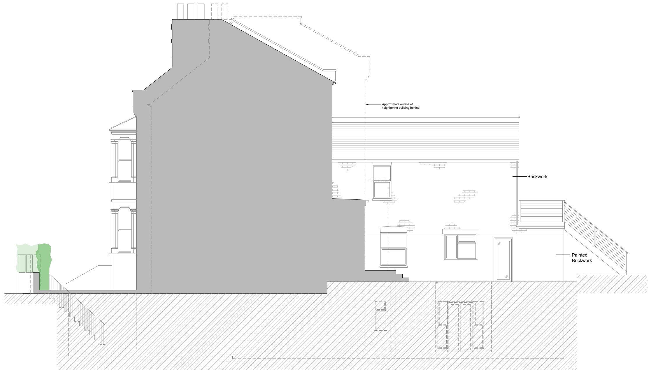
2 / Side Elevation