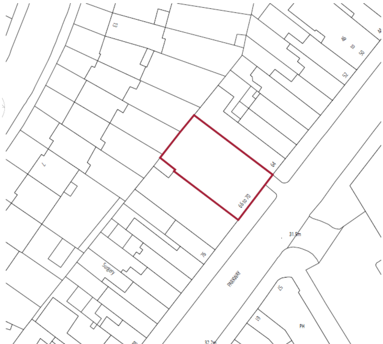
Fig 1: Site Location and Block Plan

This proposal is for the permitted development from offices (Class E) to two residential units (C3 use) on the first and second floor.