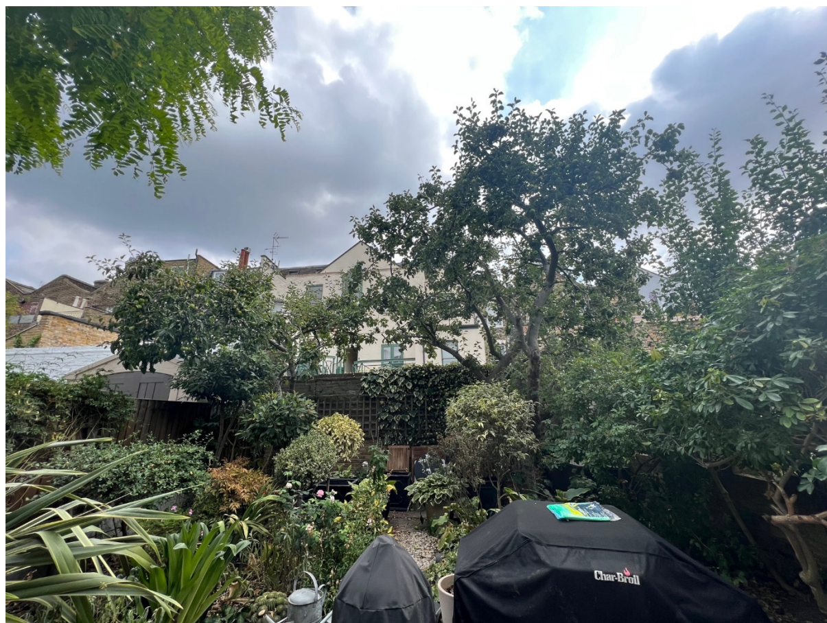
Photograph 5 21/07/2022

View from the rear of the property showing the apple trees to the rear boundary and Prunus to the flank of the property.