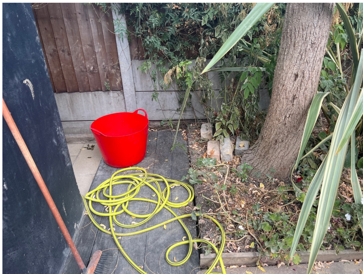
Photograph 4 21/07/2022

View from the rear of the property showing the base of the tree T1.