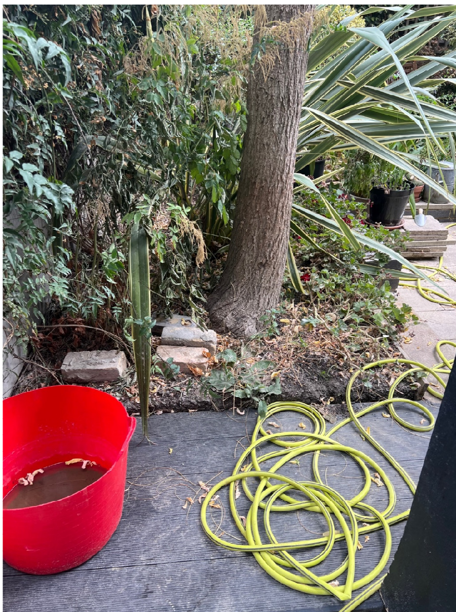
Photograph 3 21/07/2022

View from the flank of the property showing the base of the tree T1.