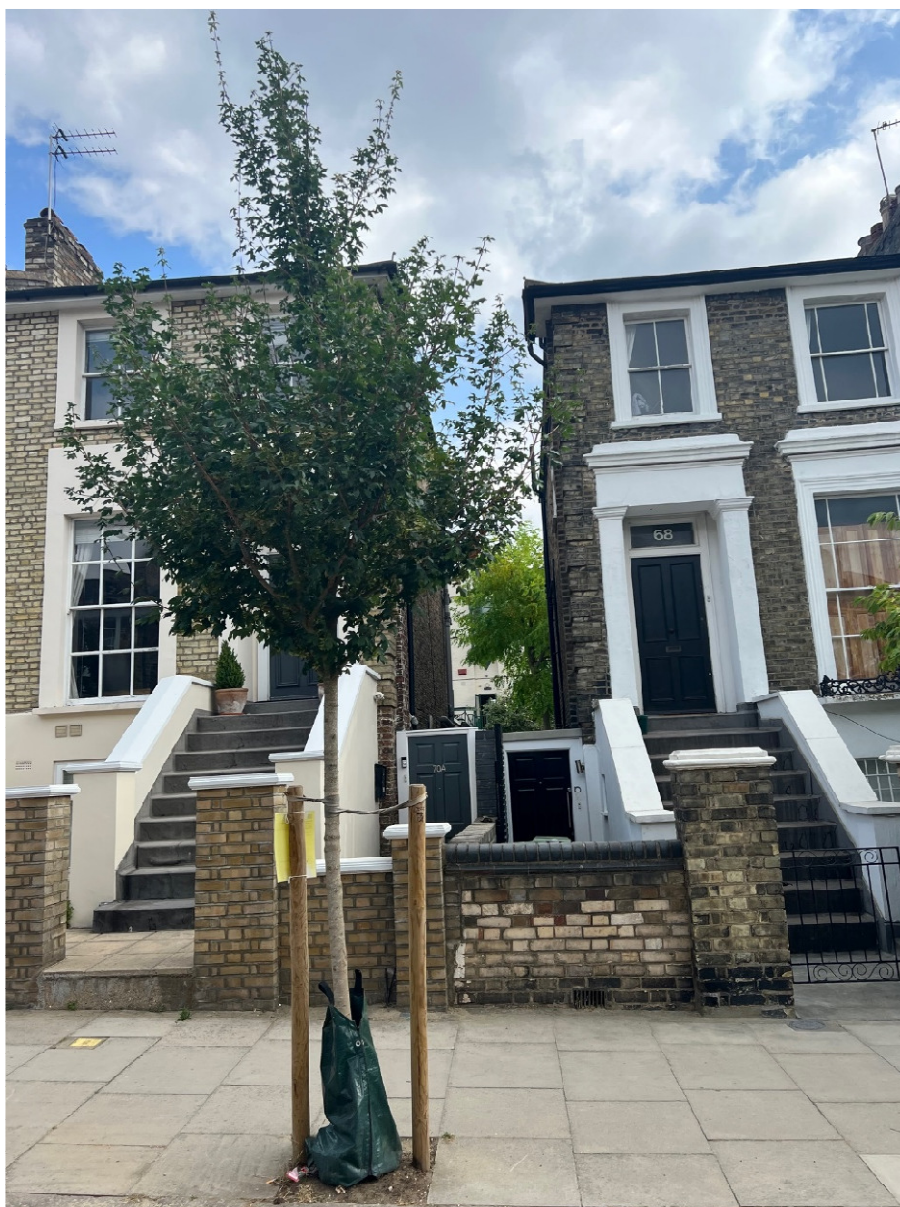
Photograph 1 21/07/2022

View from the highway showing T1 visible between the two properties.