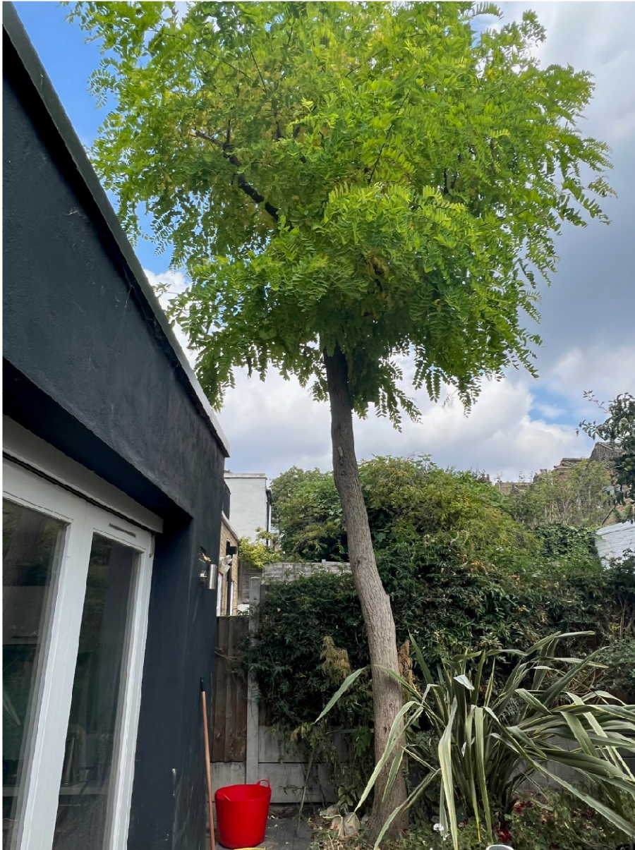
Photograph 2 21/07/2022

View from the rear elevation showing T1.