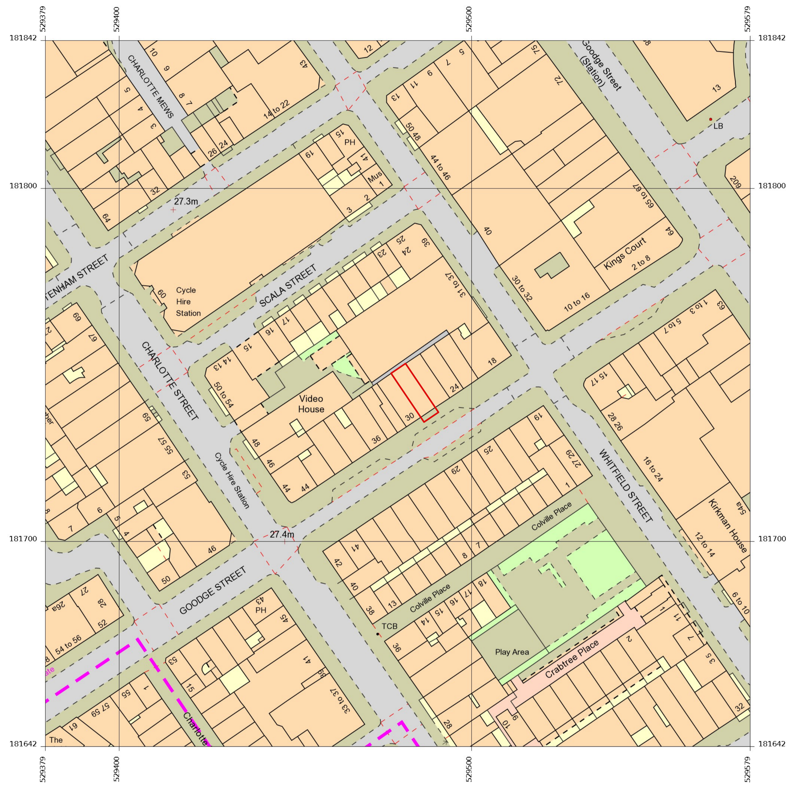
1 Existing Block Plan