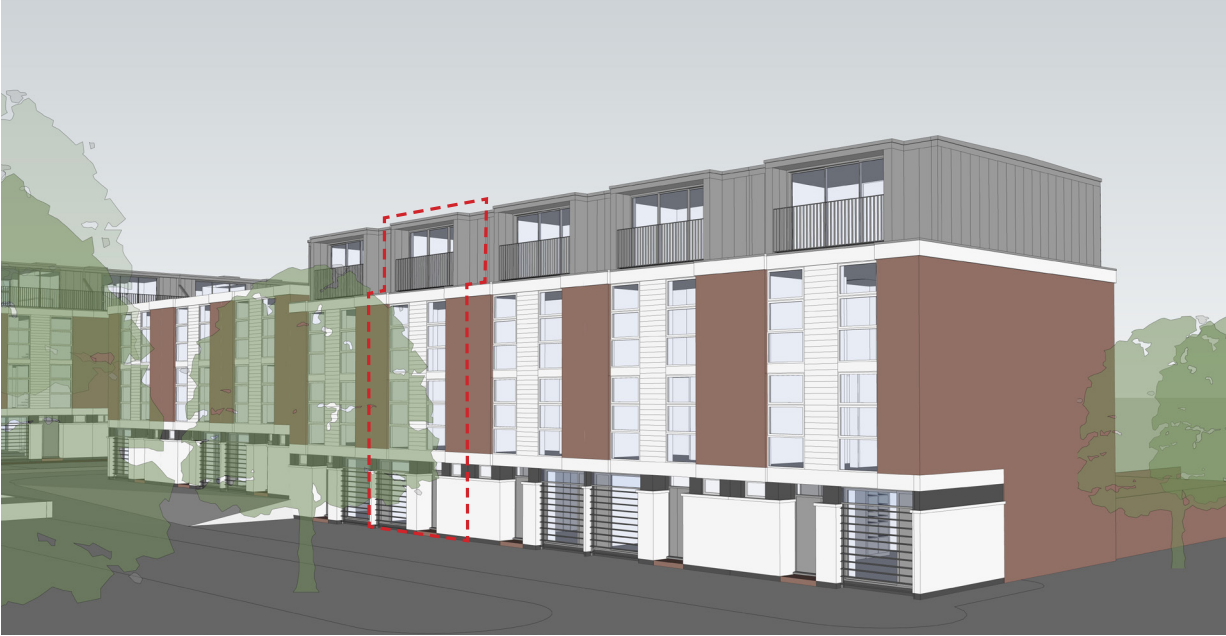
Front View (No.20 Highlighted)